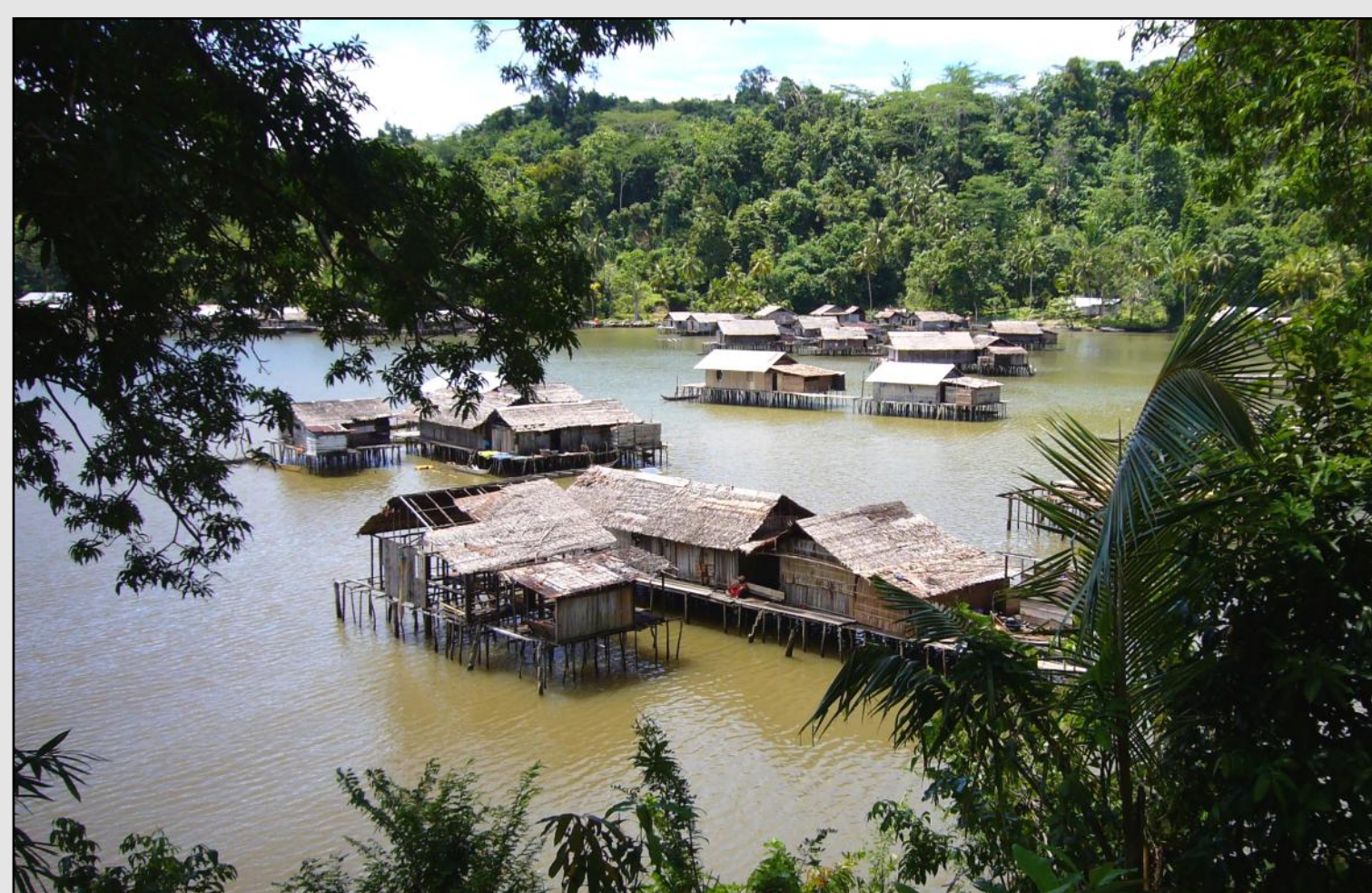
The Wool bay with traditional houses built on stilts

Wool is the term for both a language and its people settling in three coastal villages at the far western tip of Yapen Island in the Geelvink Bay. The area is largely covered by untouched primary forests that feature an enormous wealth of biodiversity. The language is of Austronesian origin and belongs to the Eastern Malayo-Polynesian branch of that family. Since four generations the Wool have increasingly been using Indonesian and approximately 1600 people still speak the language.