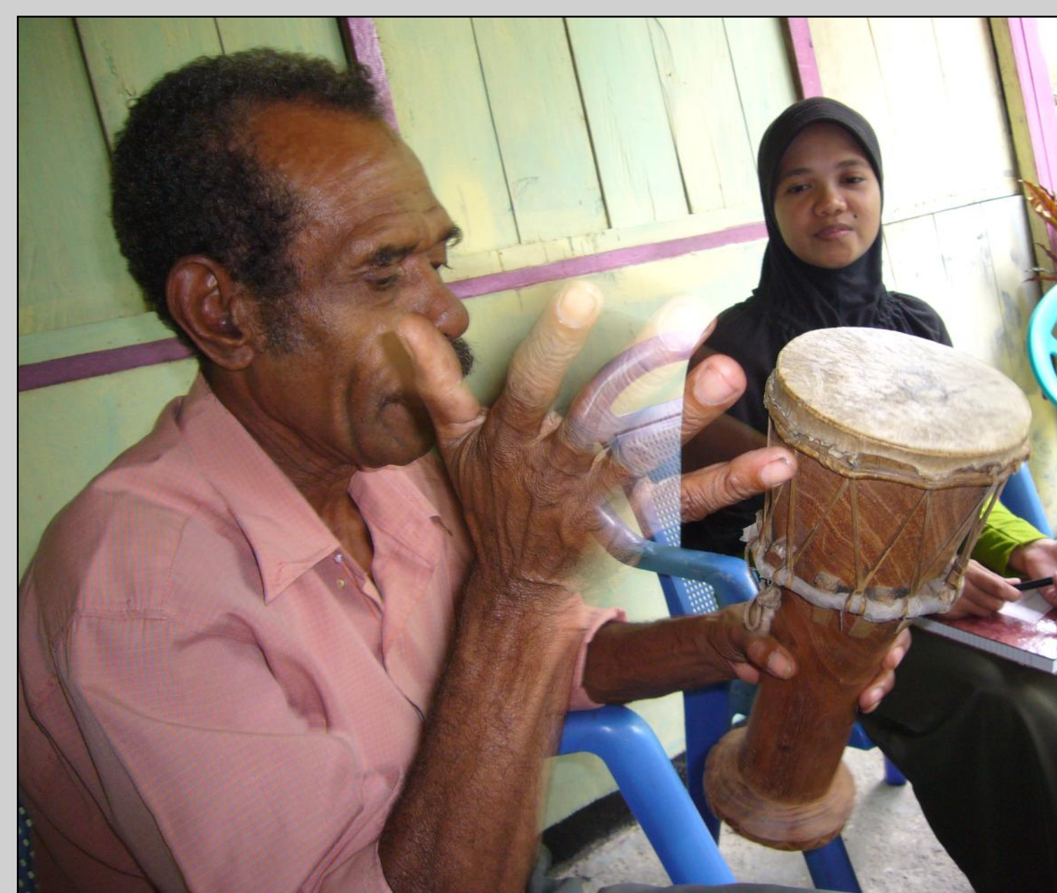
An Iha speaker playing drums

Fakfak is the melting pot of a multilingual and multicultural community. The native Melanesian inhabitants of the Iha region live together with non-Papuan people and their acculturation took place over a long period of time. There are two major religions prevalent, Islam (60%) and Christianity (40%). A strong Muslim presence in Fakfak is known since the era of the Sultanates Tidore and Ternate in 1200-1400.