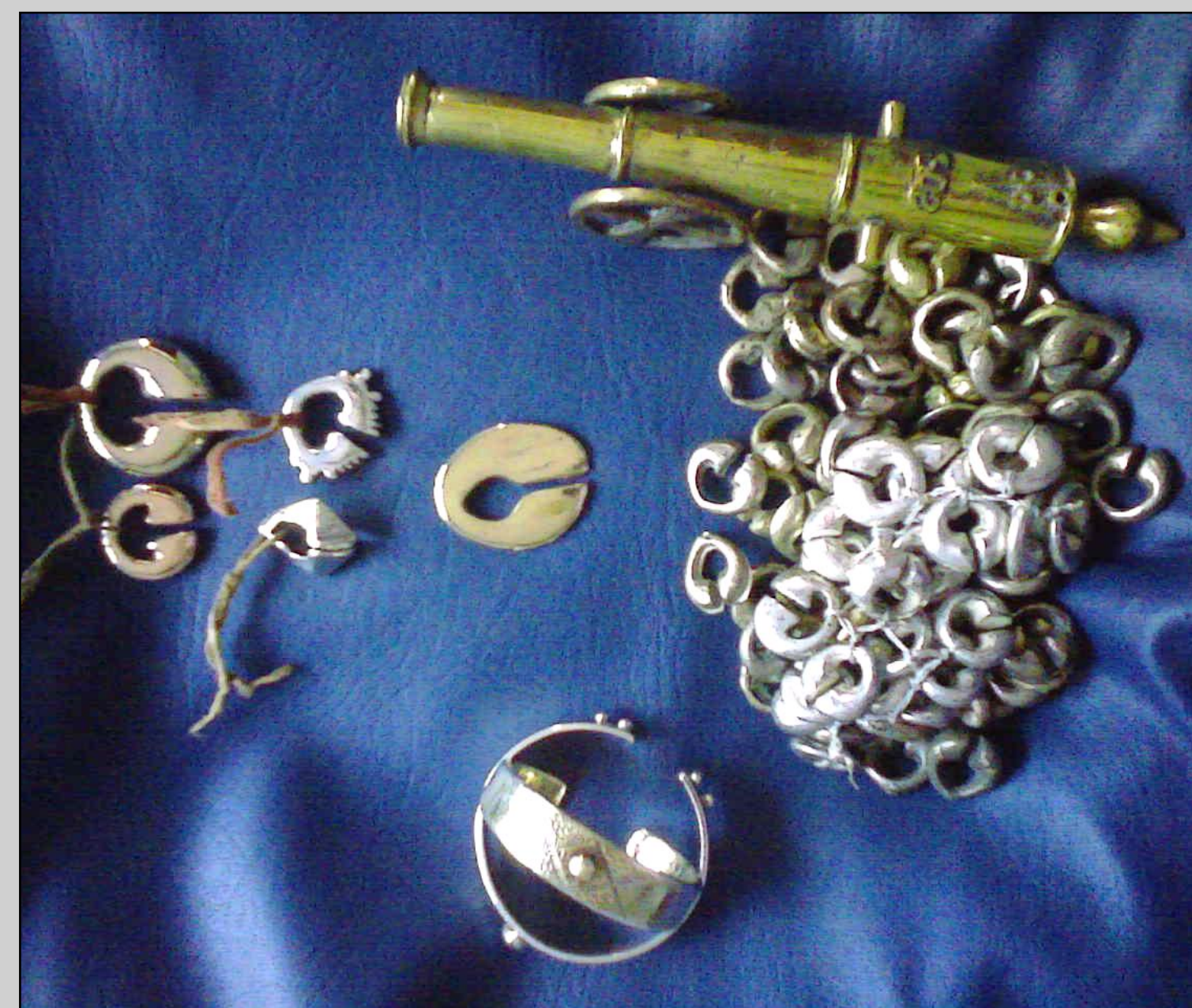
Gold to be given to the bride at an Iha wedding

Iha is spoken on the West Bomberai peninsula and is dominantly used by the Fakfak and Kaimana people. The term Iha refers to an ethnic group or even to one specific clan. It is still spoken by about 5,500 people in approximately 48 villages. Iha is classified as belonging to the Trans-New Guinea family (West Bomberai Proper).