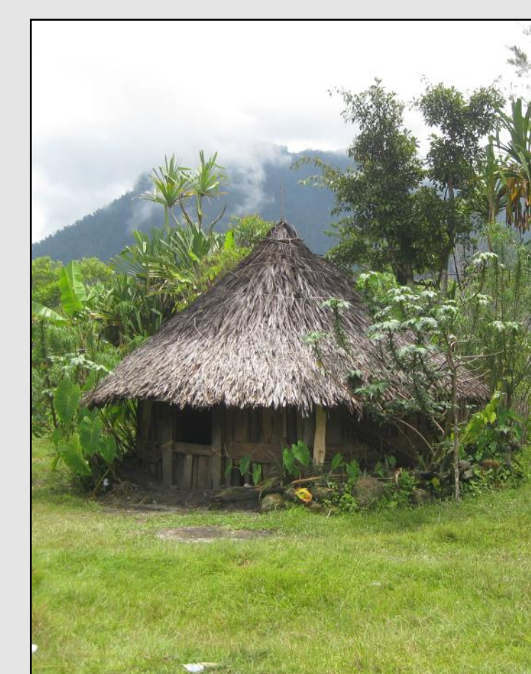
A "Honai" - the traditional Yali housing

Like most peoples in the Papuan highland area, the Yali, Yale, and Eipo are sedentary horticulturists. Their gardens are laid out on the steep mountainsides, where sweet potatoes, taro, and other vegetables are cultivated. The villages and hamlets of the respective speech communities are located on the top of the mountain ridges. Nowadays almost all the mountain peoples are Christians, having been Christianized by Dutch, German, and American missionaries who are working in that area since the 1960ies.