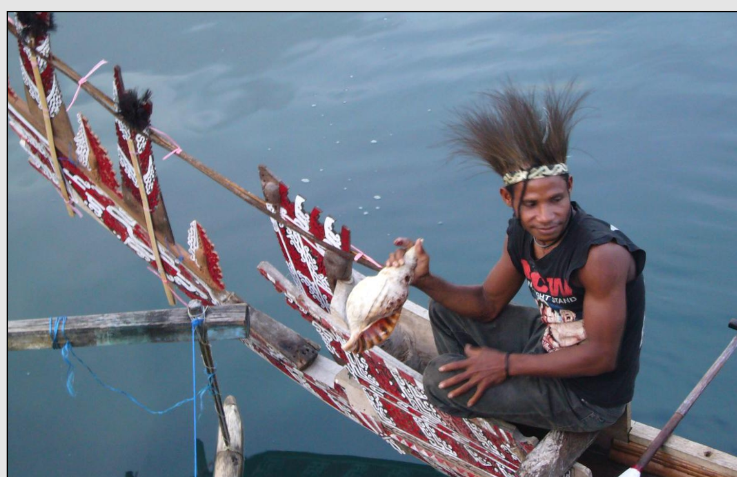
Wool traditional canoe

Wool are organized in clans, who descend either from Yapen, the Bird's head or the neighboring island Biak. They are traditionally fishermen, diversifying their subsistence economy by horticulture and trading sago. Their houses are built on stilts just off shore facing the bay. Most Wool are Protestant and the political power is shared by two elected village heads. Inter-ethnic warfare was common in colonial times and traditional Wool songs from that time are still orally transmitted today. Of particular ethnological interest is a specific peace-building ritual called hesokuru, practiced by the Wool to overcome special cases of interpersonal disharmony.