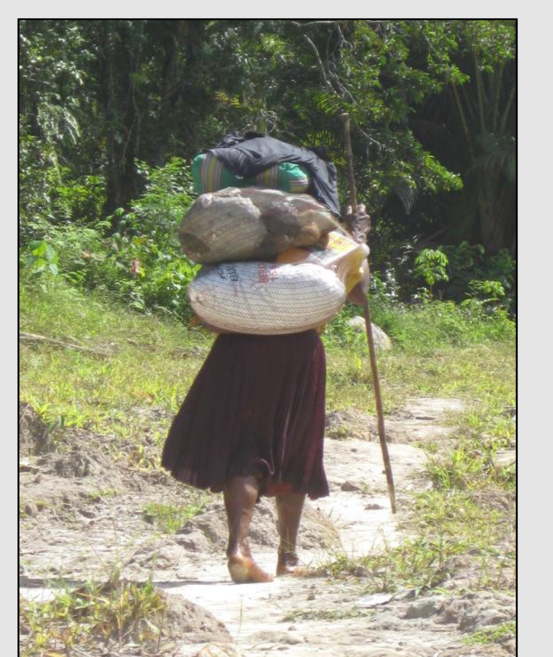
A Yali woman carrying home her harvesting