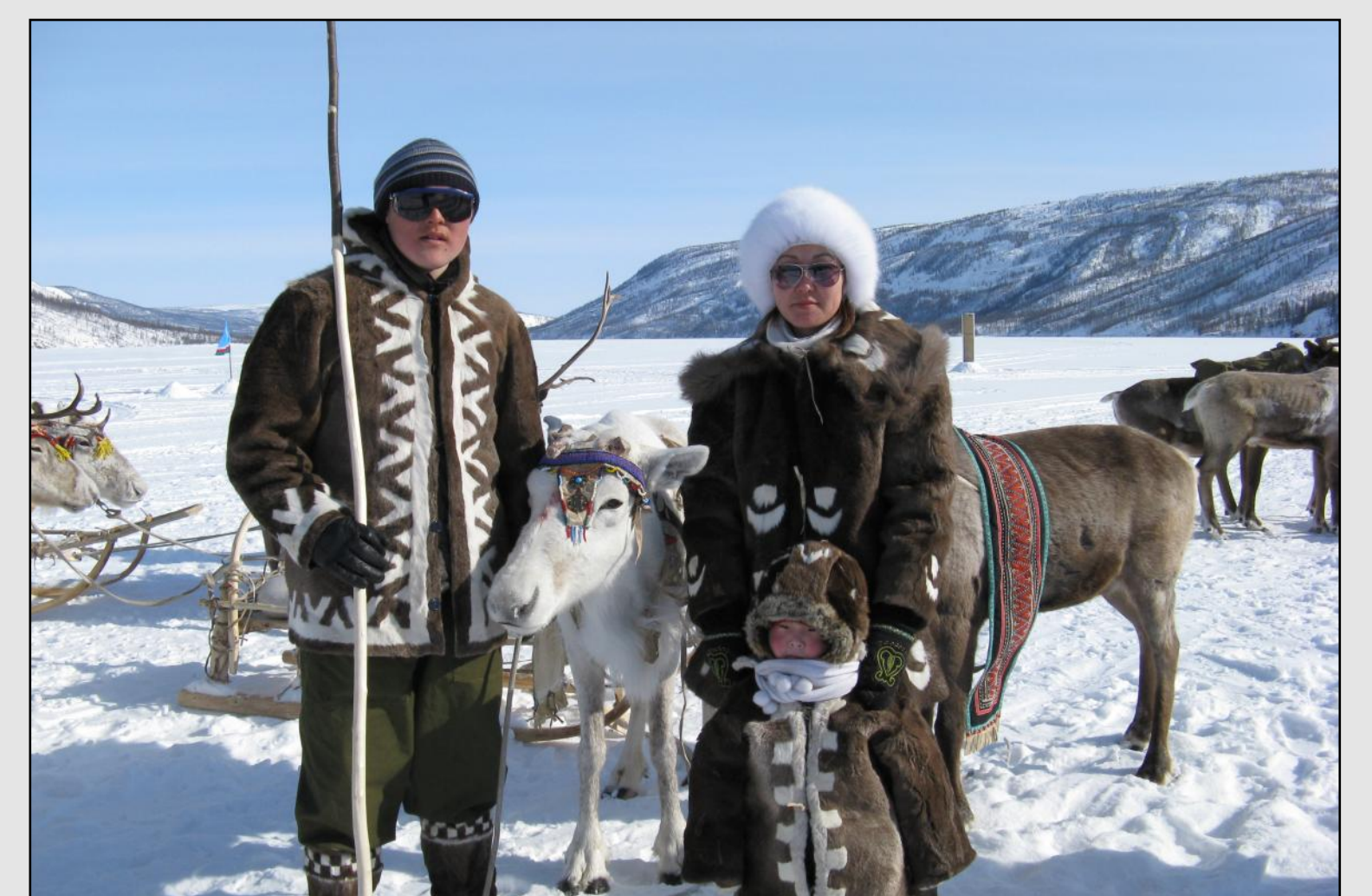
Traditional dress (Sebjan-Küöl)

seasons horses may provide an alternative means, in winter snowmobiles are also used. In the area of Topolinoe horses are kept only by some people who have relatives among Yakut horse herders.