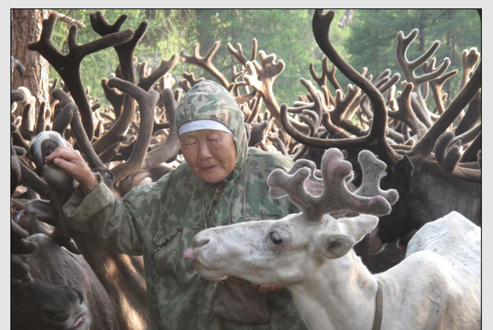
Woman with a sacred reindeer (called "edjek") (Topolinoe)