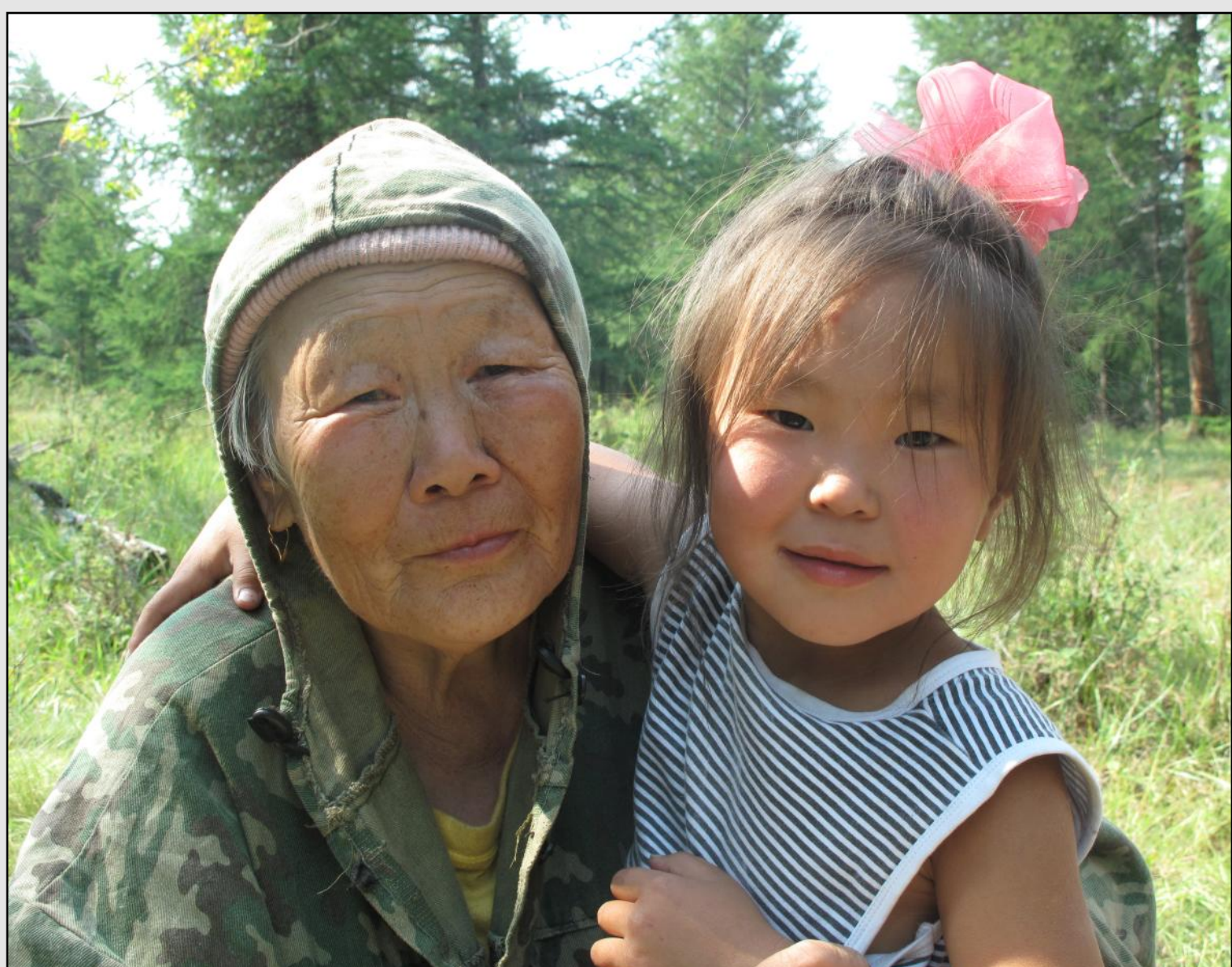
Woman with her granddaughter (Topolinoe)

Even is a North Tungusic language spoken over a vast area of northeastern Siberia, from the Lena-Jana watershed in the west to the coast of the Okhotsk Sea, Chukotka, and Kamchatka in the east. Two major dialectal groups, Western and Eastern, and twelve dialects are recognized, some only marginally mutually intelligible.