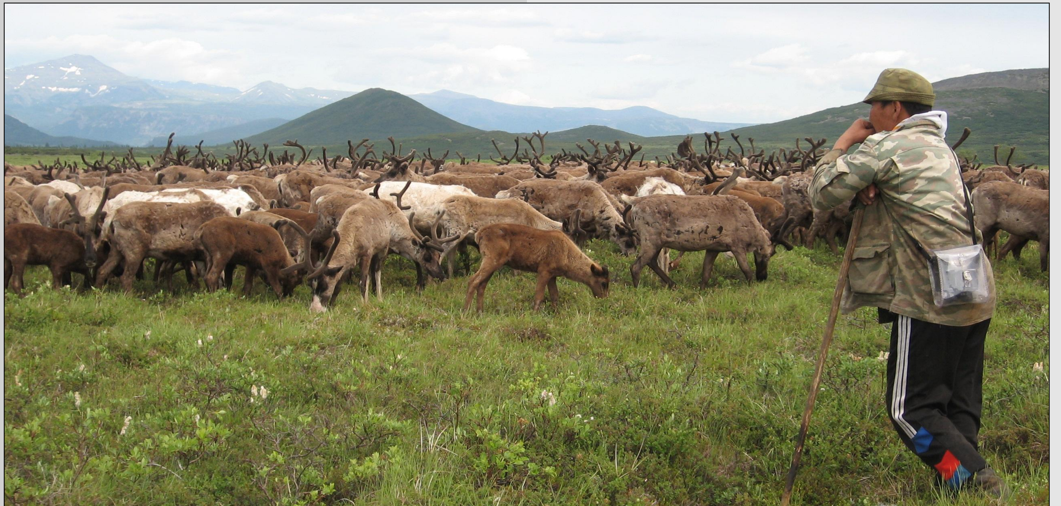
Reindeer herd with herder (Kamchatka)