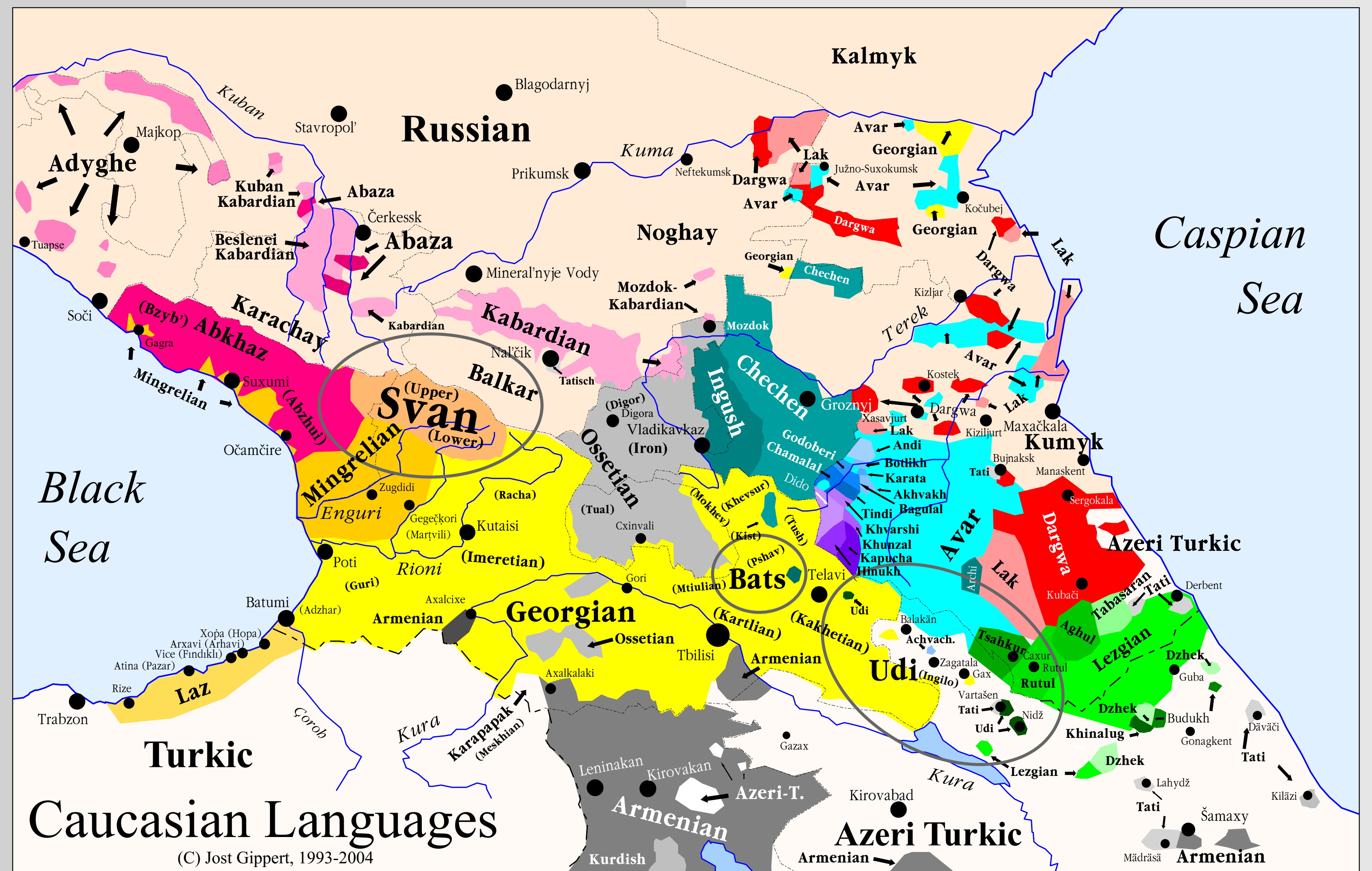
The linguistic diversity of present-day Caucasias

The ECLinG project focusses on three endangered Caucasian languages spoken in present-day Georgia, viz. Tsova-Tush, Svan, and Udi.