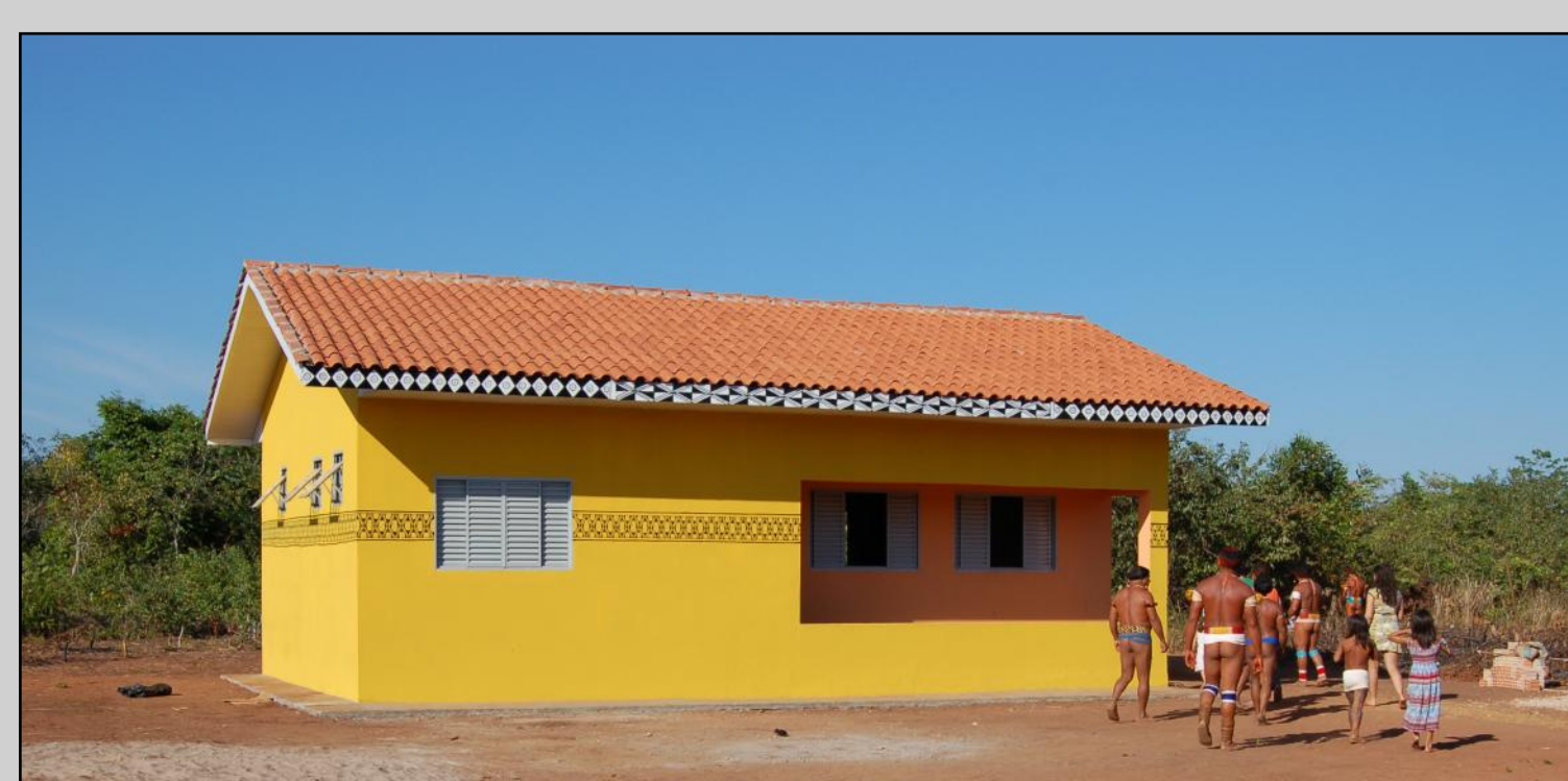
The Documentation Center, Ipatse village (Carlos Fausto, 2007)