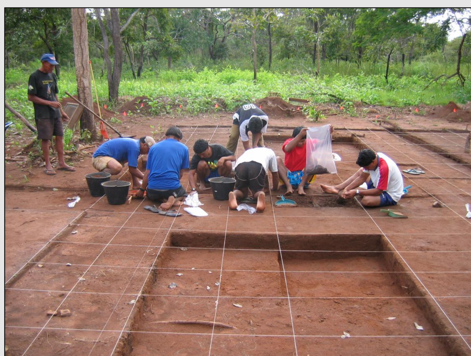
The archaeological team, conducted by Michael Heckenberger, works near the village of Ipatse (2005)

All these materials are stored also at the Museu do Índio-FUNAI, Rio de Janeiro (Brazil), as a consequence of the agreement signed by Brazilian Institutions and MPI for technological collaboration (LAT). http://app02.museudoindio.gov.br/ds/imdi_browser/