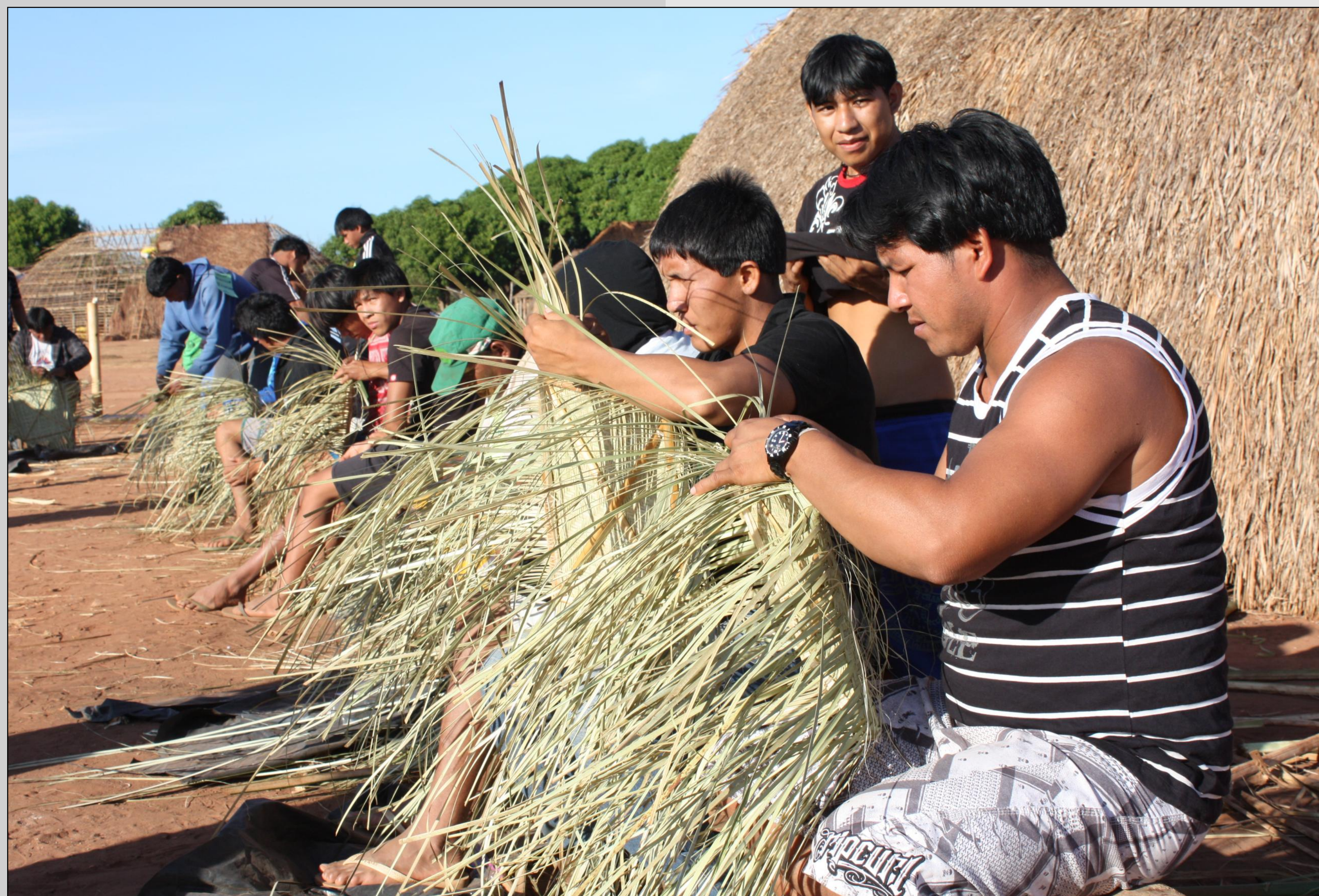
Workshop on the art of making baskets, Ipatse village

Since the firsts years of the DOBES project, Kuikuro people are actively involved in linguistic and cultural documentation, with their own initiatives and projects. We, the researchers from outside, are, now, their consultants.