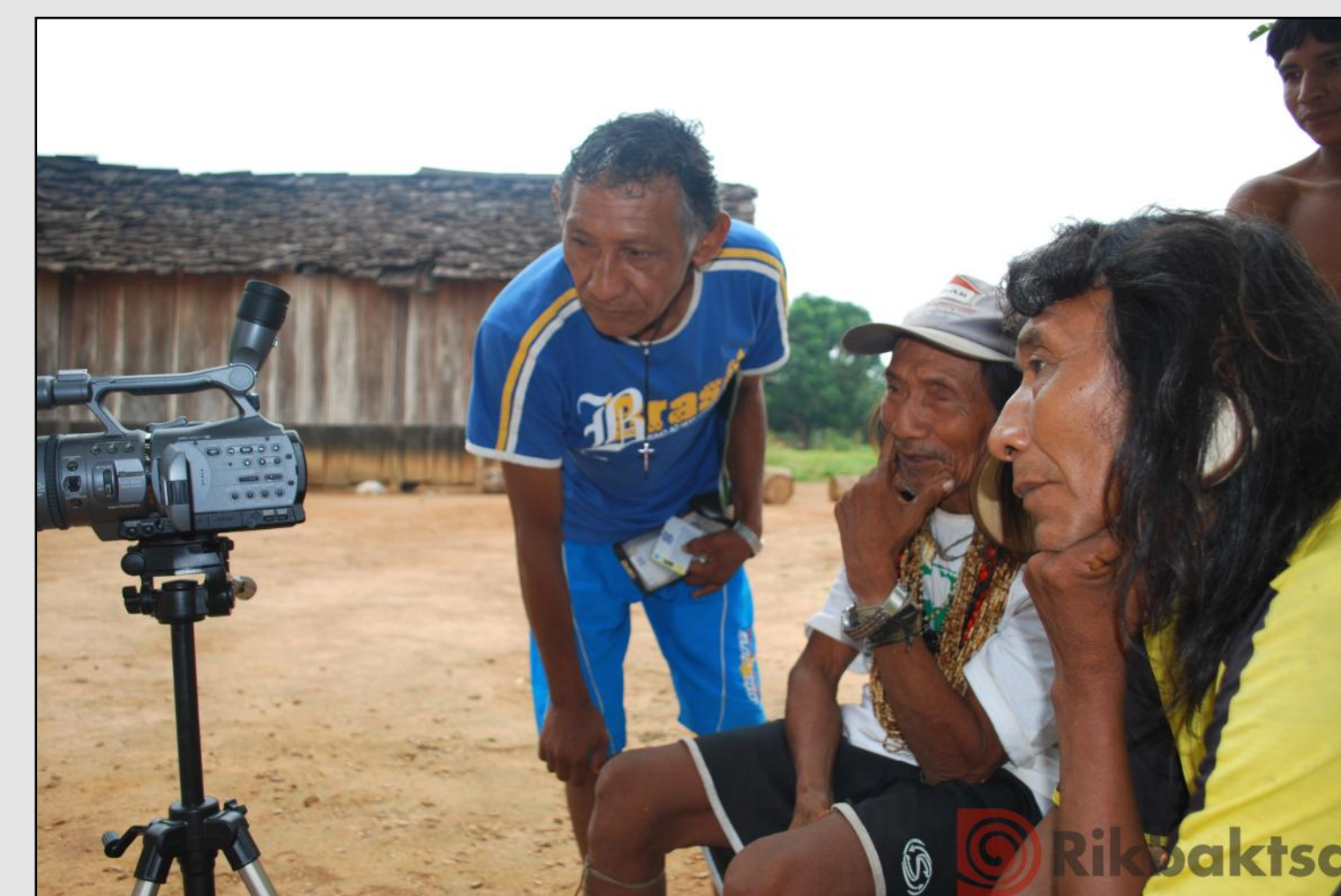
Training workshop in a Rikbaktsa village (2011)

185 DVDs sent back to the indigenous communities.