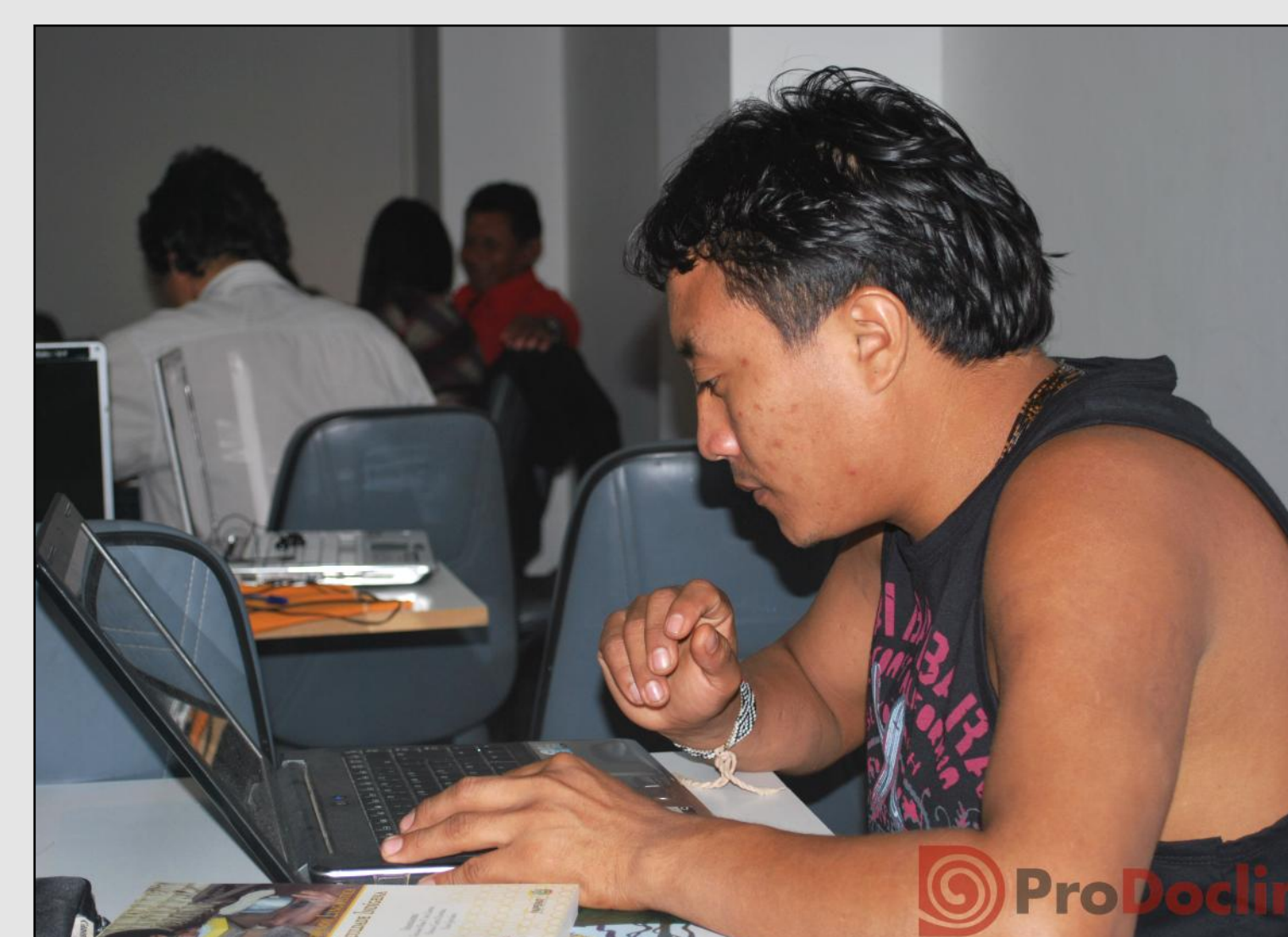
Training course at the Museu do Índio-FUNAI, Rio de Janeiro (2011)

Perspectives 2013-2014: New languages to be documented; 5 new projects for the development of didactical grammars.