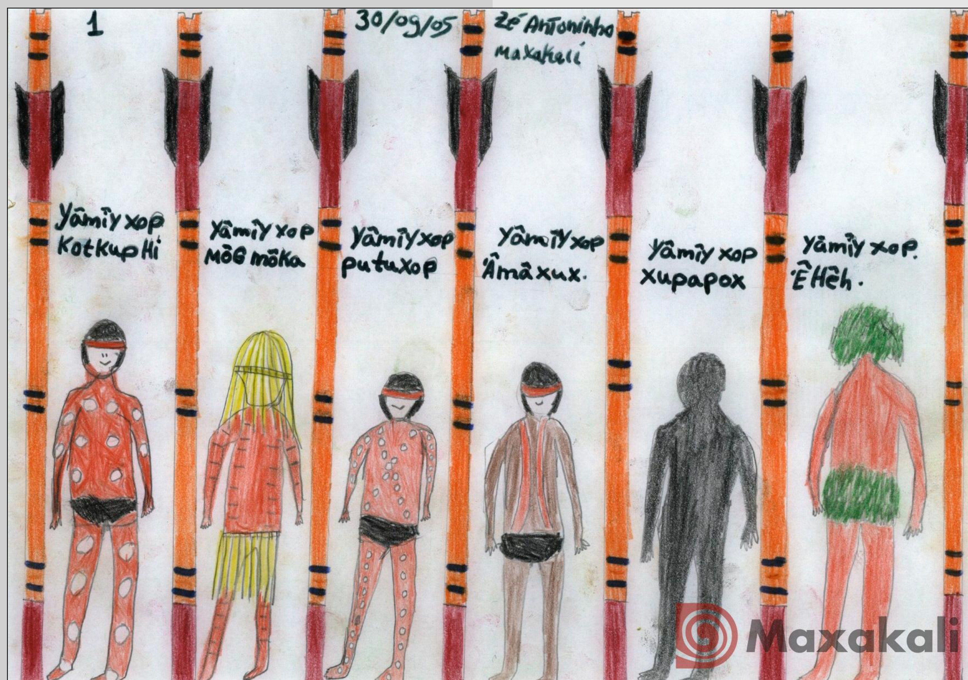
A drawing representing supernatural beings, from the MAXAKALI Project Archive

Localization of the PRODOCLIN projects (@ Priscilla Alves de Moura)