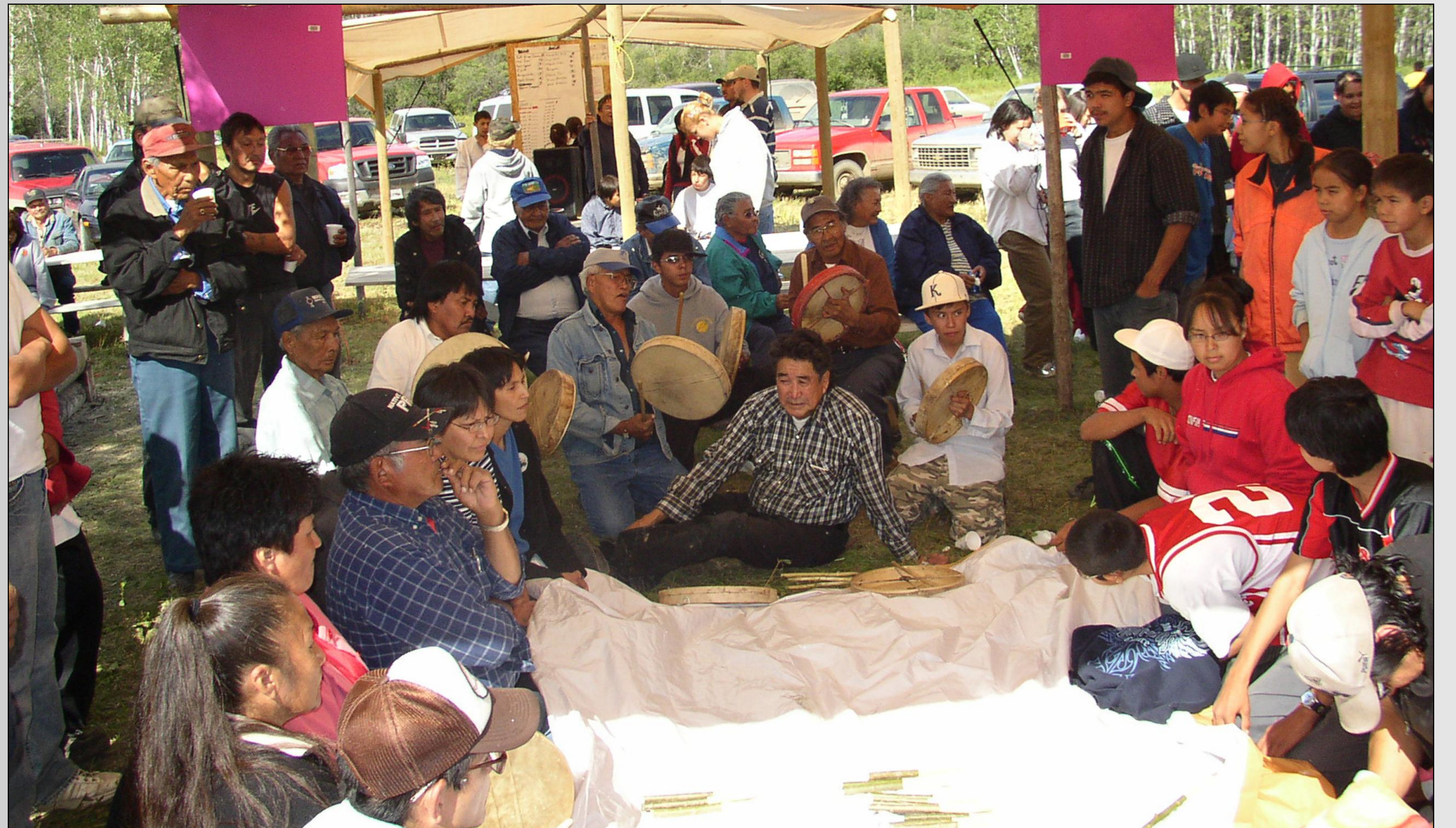
Playing Handgames has seen a growing interest from the Native communities in the area. Originally the games were held to determine who had the greatest spiritual power, while nowadays the competitions are entertaining social gatherings and a celebration of Native culture. Accompanied by drummers two teams of seven players compete in guessing in which hand a little object is held.

The documentation of stories that happened together with the community revealed also a contemporary framing of narratives that ties the present and the past together.