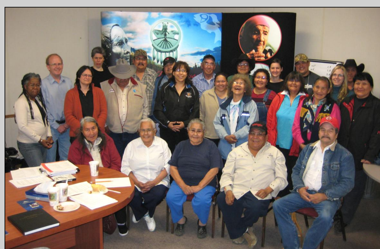
Workshop on the Dane-zaa language at Fort St. John in 2008. Language teachers, elders, and linguists came together to compare dialects and share stories.