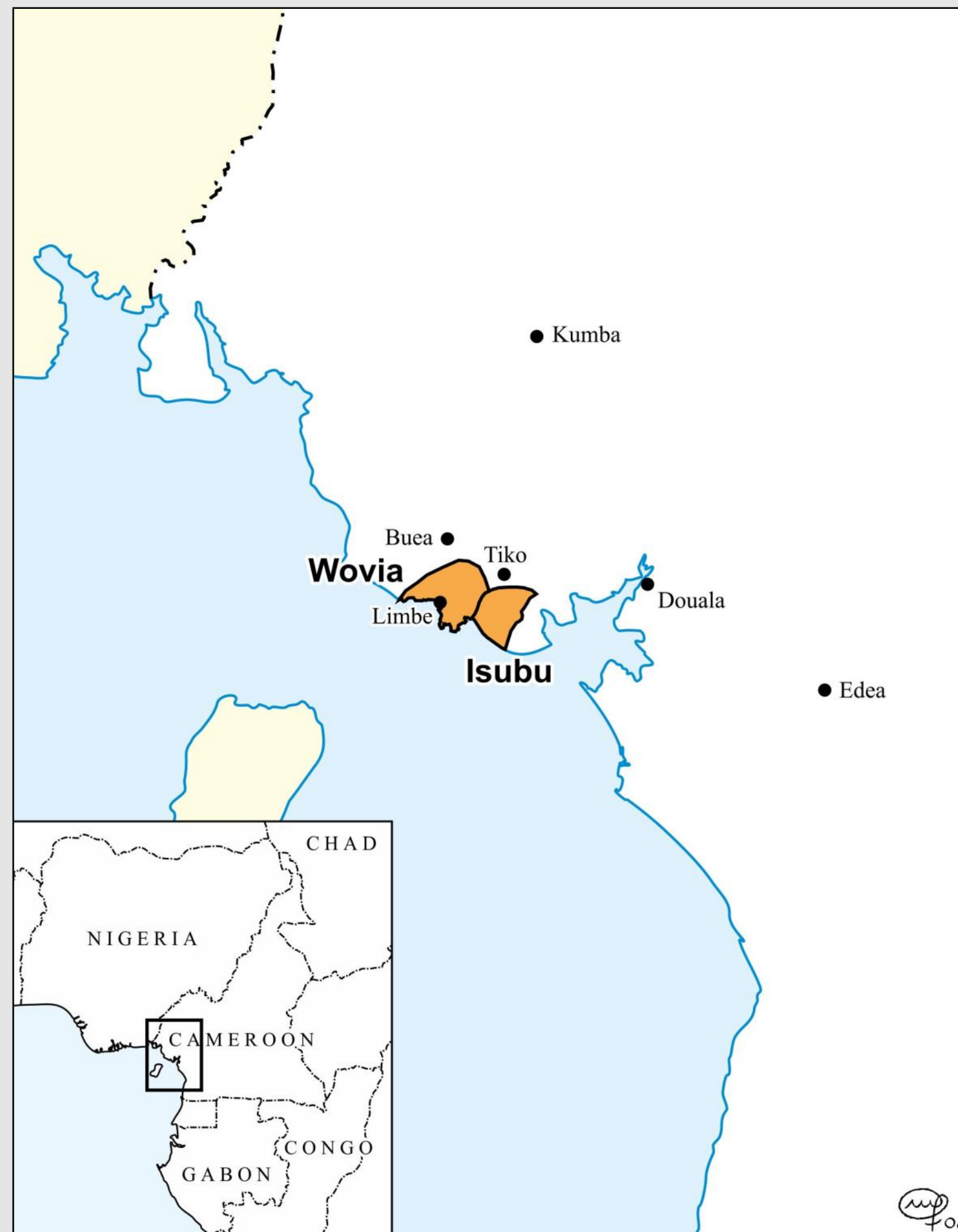
Location of Isubu

Isubu is spoken in Bimbia in the coastal area of the South-West Region of Cameroon. Bimbia comprises three villages - Bona Ngombe, Bona Bile and Dikolo.