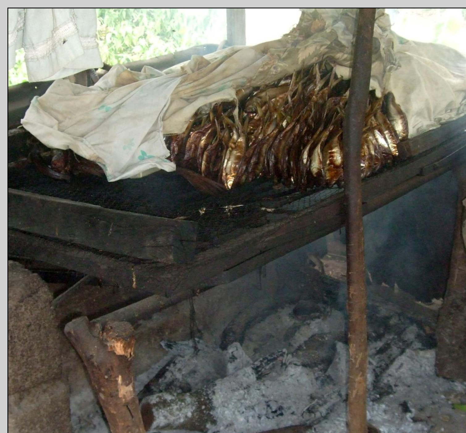
Drying of fish

The Isubu are multilingual, so code-switching and code-mixing are very common. The relations between the various languages spoken in the area must have changed several times. For example, Mokpe and especially Douala have been the dominant languages of the area. Since the influx of migrant workers, however, Cameroonian Pidgin English has gained increasing relevance as a lingua franca. Thus, while many elder Isubu speak Douala and/or Mokpe, younger speakers rather use Pidgin English. For many of them it has even become the mother tongue. Isubu has lost its function as a public language being largely confined to private homes, closely-knit groups and specific festivities.