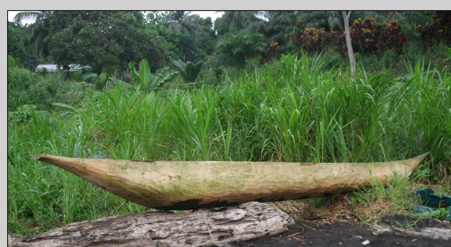
Dug out canoe

With the social, cultural and economic changes of the past decades, many practices have largely been given up - among them fishing and the drying of fish, which have been the main subsistence. On the one hand, the urban centres offer numerous job opportunities. On the other hand, fish resources are declining and fishing does no longer suffice as source of income. Moreover, modern technologies like fridges have rendered techniques like the drying of fish almost obsolete.