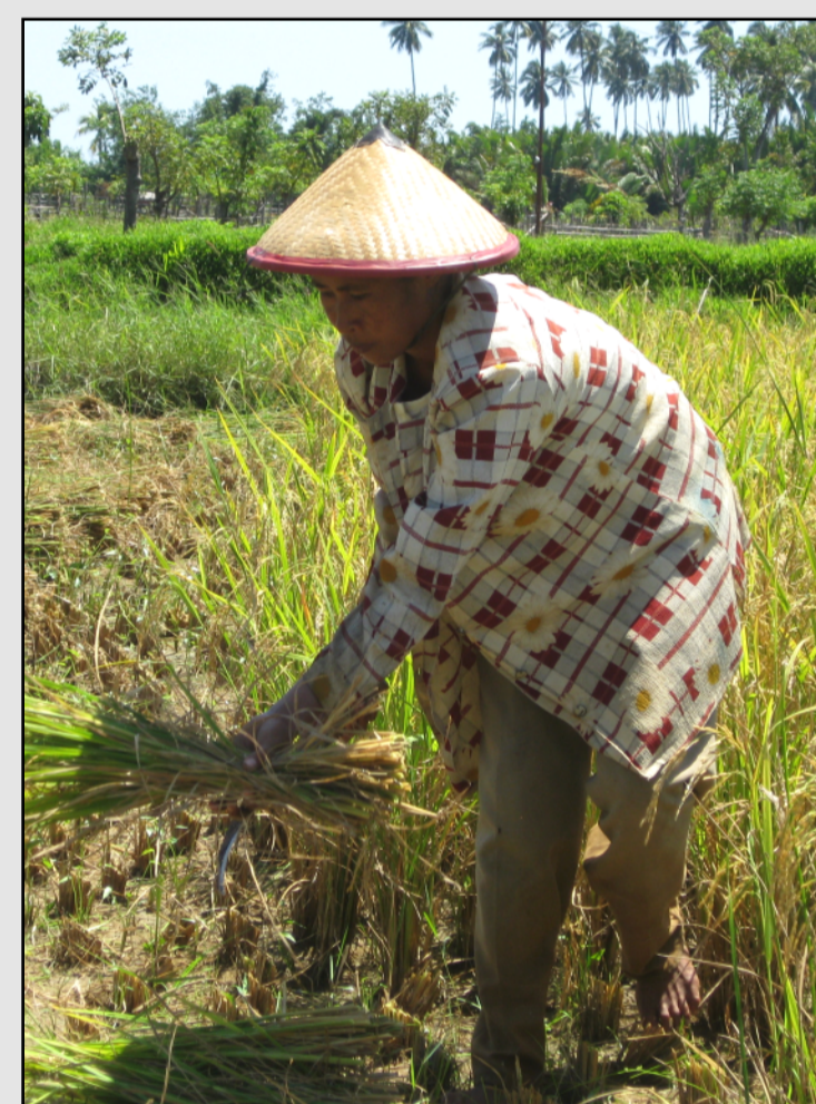
The staple food: rice

There are two main areas where Totoli is spoken, one centered around the city of Tolitoli, the other one being located in four villages in the north of Tolitoli (see map). The dialects spoken in these two areas show