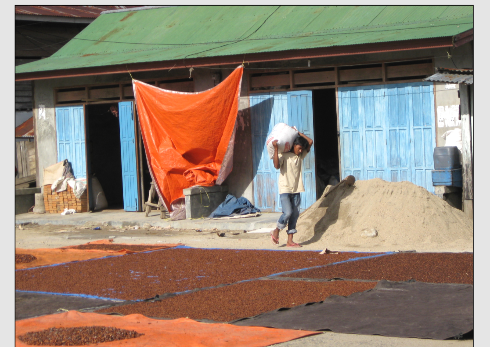
The major local cash crop: cloves

many rhyming two-liners as possible where the first line always consists of the name of a part of a plant (the blossom of the Aren tree, etc.) and the second line conveys a political or situational commentary (i.e. it is completely ad-hoc).