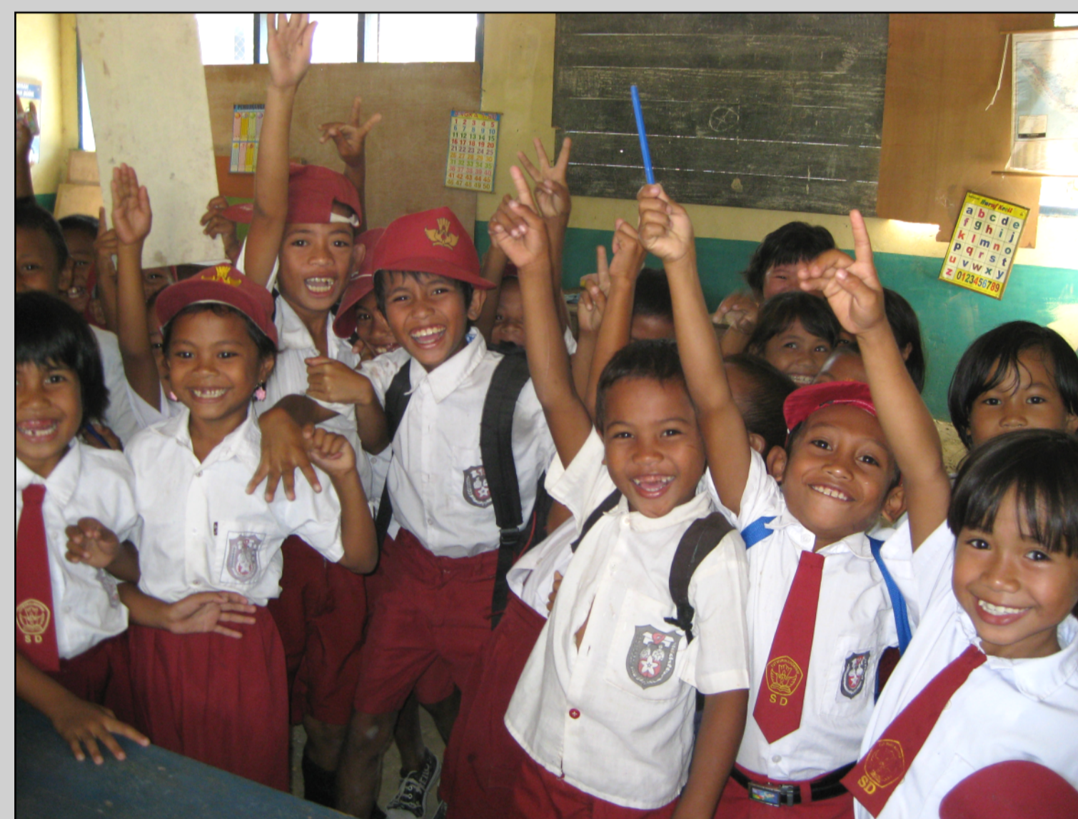
Kids at primary school

some crucial grammatical differences, and also their degree of vitality differs considerably: while the loss of Totoli is unfortunately well advanced in and around Tolitoli, the language is still used in everyday life in the northern language area.