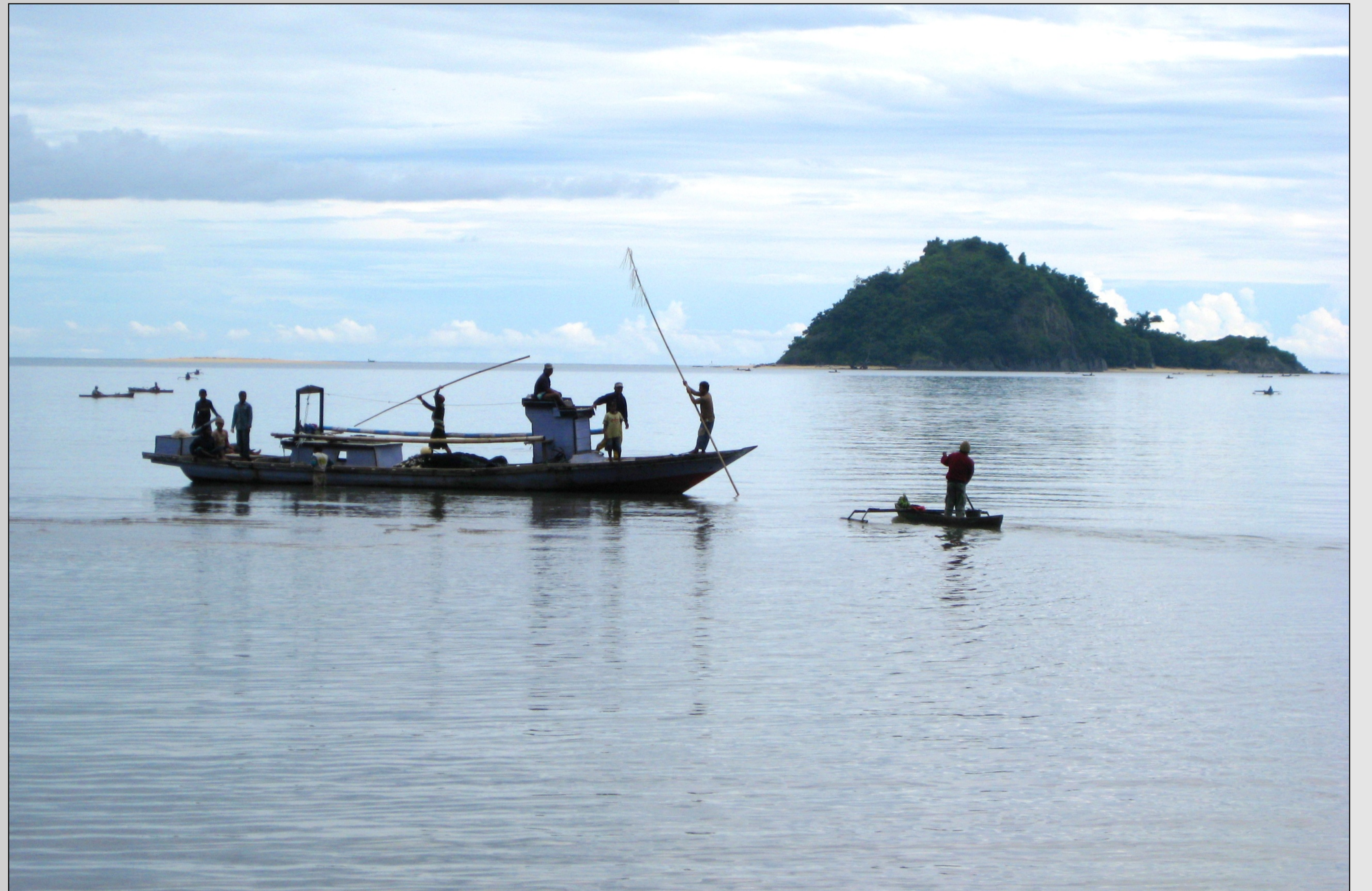
Fishermen at work

There are two main areas where Totoli is spoken, one centered around the city of Tolitoli, the other one being located in four villages in the north of Tolitoli (see map). The dialects spoken in these two areas show