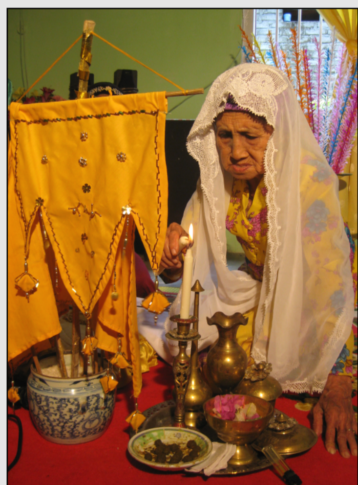
A Totoli village elder preparing a wedding ceremony

Of the overall Totoli population of about 25,000 people probably less than 5000 are fluent speakers. A widespread pattern in families is for family members over 50 to be fluent, and for members between 20 and 50 to have a good passive knowledge. Children and teenagers know very little, if anything, of the language, usually exclusively speaking the local variety of Malay.