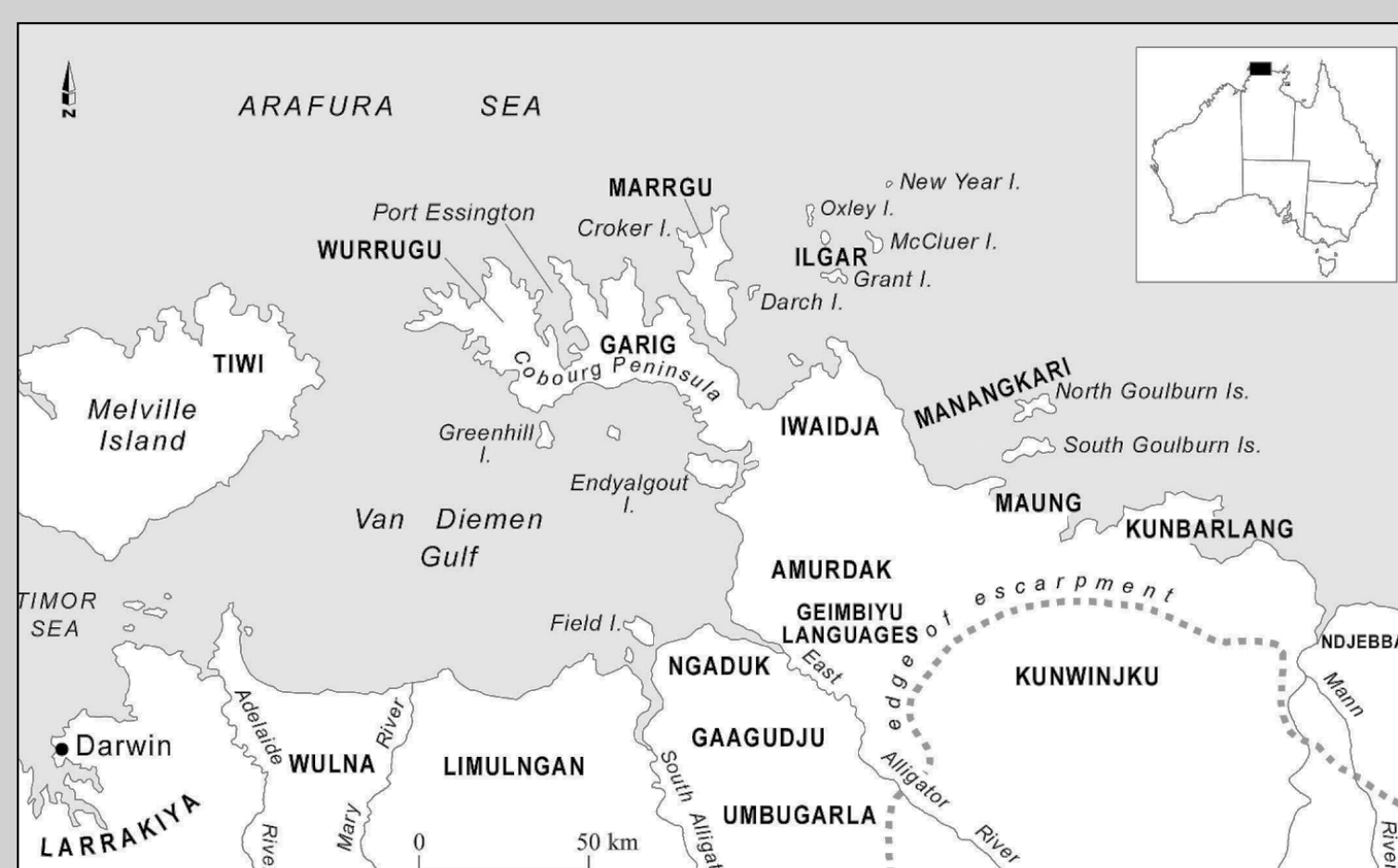
Language map of the study region

Another focus of the project was on recording and transcribing traditional songs. Every language group has its own distinctive song style, such as the Jurtbirrk style sung in the Iwaidja language (see score), or the Yanajanak style associated with the Amurdak people of the inland 'stone country'.