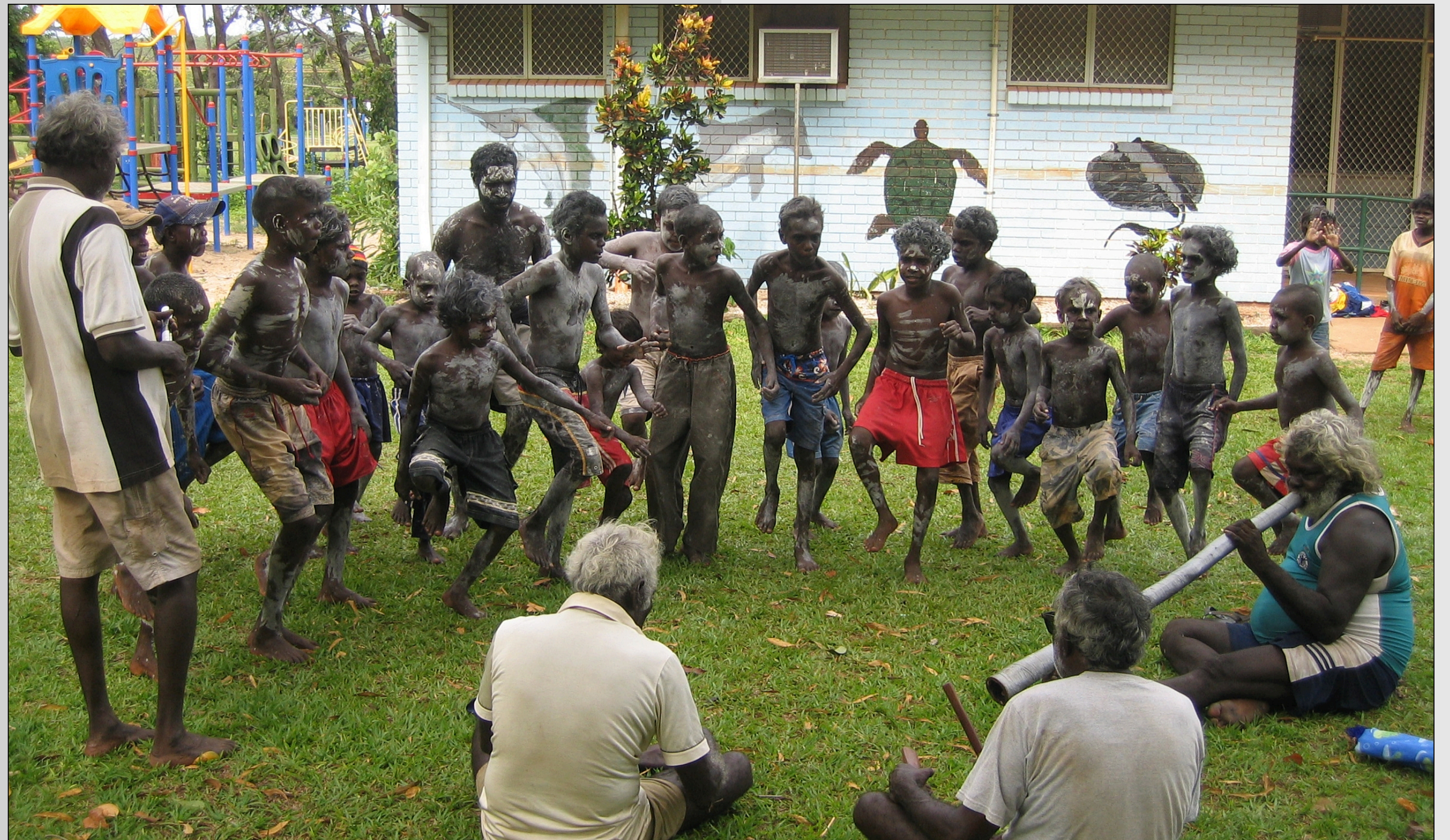
Recording Yanajanak songs feeds into the revival of traditional song and dance

The Cobourge Peninsula region of Northern Australia is one of the most linguistically diverse regions on earth. It contains a third of Australia's twenty-five language families, and nineteen distinct languages in an area the size of Belgium with a population of only a couple of thousand. The Iwaidjan family (see family tree), which formed the focus of this project, originally contained five distinct languages (counting Ilgar and Garig, and Maung and Manangkari, as pairs of sister dialects). Of these, only Maung and Iwaidja still have significant numbers of speakers (100-200 in each case). Within the small community of Minjilang, on Croker Island (population around 300), where the project had its field headquarters, live speakers of around ten indigenous languages. Many languages of the region, however, have recently become extinct, or, as with Ilgar and Amurdak, are down to the last one or two speakers. In some cases, such as Marrgu, there are no remaining 'speakers', but thanks to the generation who can still 'hear' the language our project was able to transcribe and translate some earlier recorded materials that would otherwise have been uninterpretable. One arm of the project recorded as much of these severely endangered languages - Marrgu, Ilgar, Garig and Amurdak - as was possible with the last remaining speakers and hearers.