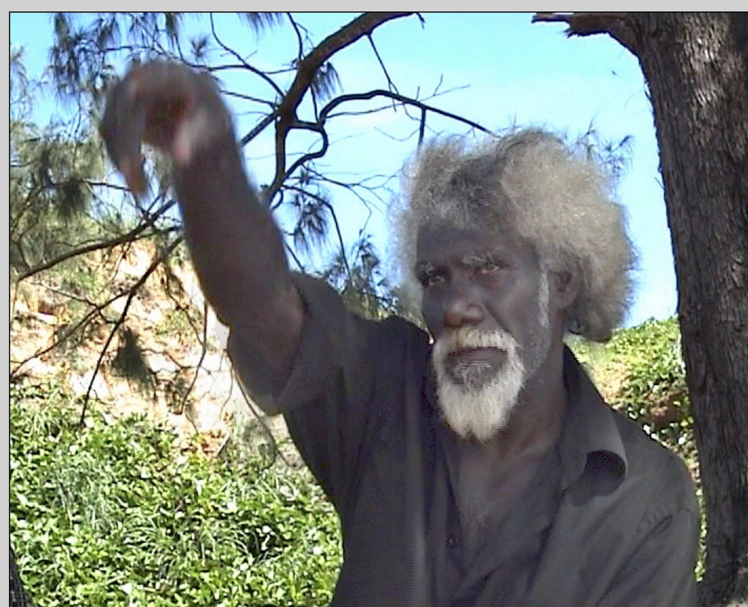
Telling the story of Wamba the shark

Iwaidja, the main language of the project, is still the vehicle of a living culture, and here we concentrated on documenting the full gamut of traditional contexts within which the language is used, including hunting, fishing, butchering, plant use, the gathering, preparation and cooking of 'bush tucker' such as wild yams, geographical and ecological knowledge, terms for kinship and social categories such as clans, and language associated with the manufacture of traditional stone and wooden implements. Traditional place names and myths associated with the 'dreaming tracks' laid down by founding ancestral figures such as Wamba the shark were also recorded in detail. Often renditions of these stories involve several different languages according to which character is speaking and which country they are passing through.