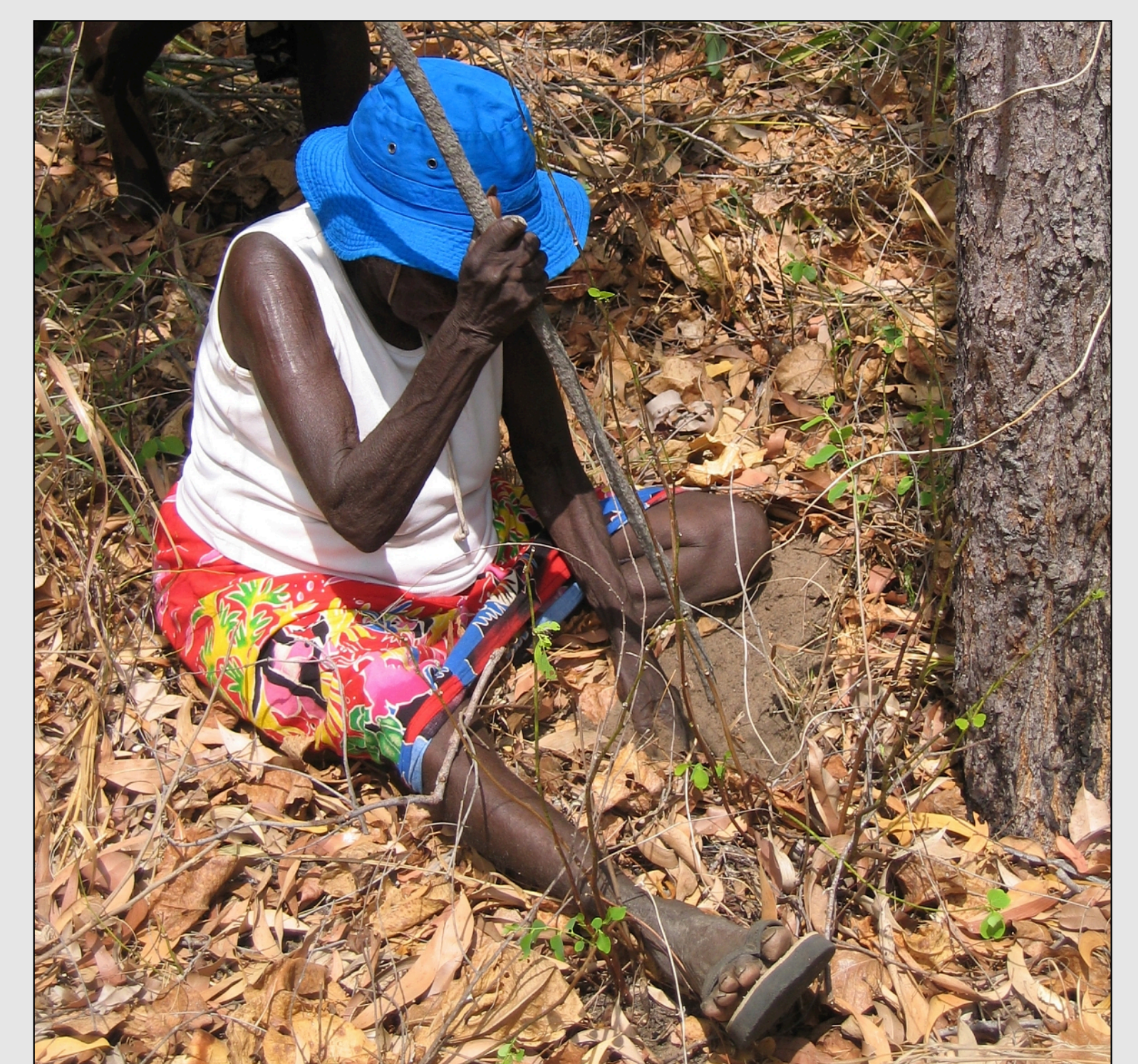
Going for Idungun 'long yam'