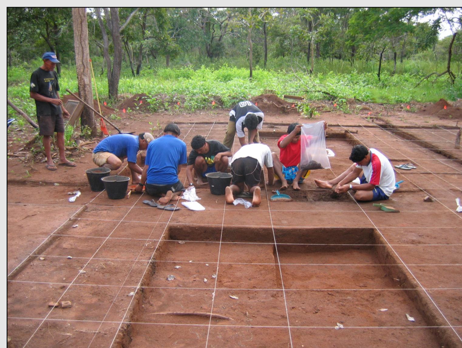
The archaeological team, conducted by Michael Heckenberger, works near the village of Ipatse (2005)

All these materials are stored also at the Museu do Índio-FUNAI, Rio de Janeiro (Brazil), as a consequence of the agreement signed by Brazilian Institutions and MPI for technological collaboration (LAT). http://app02.museudoindio.gov.br/ds/imdi_browser/