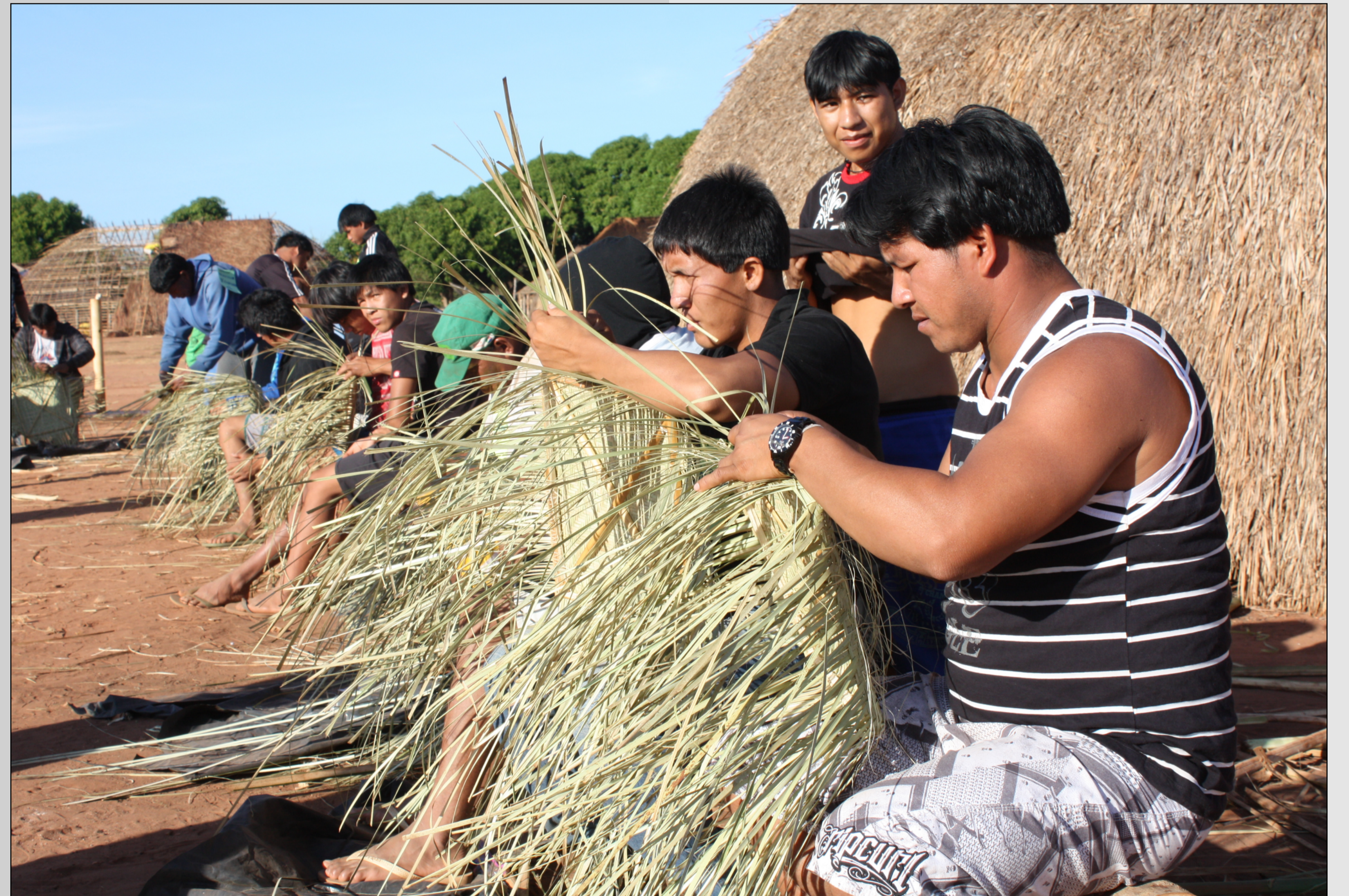
Workshop on the art of making baskets, Ipatse village

Since the first years of the DOBES project, Kuikuro people are actively involved in linguistic and cultural documentation, with their own initiatives and projects. We, the researchers from outside, are, now, their consultants.