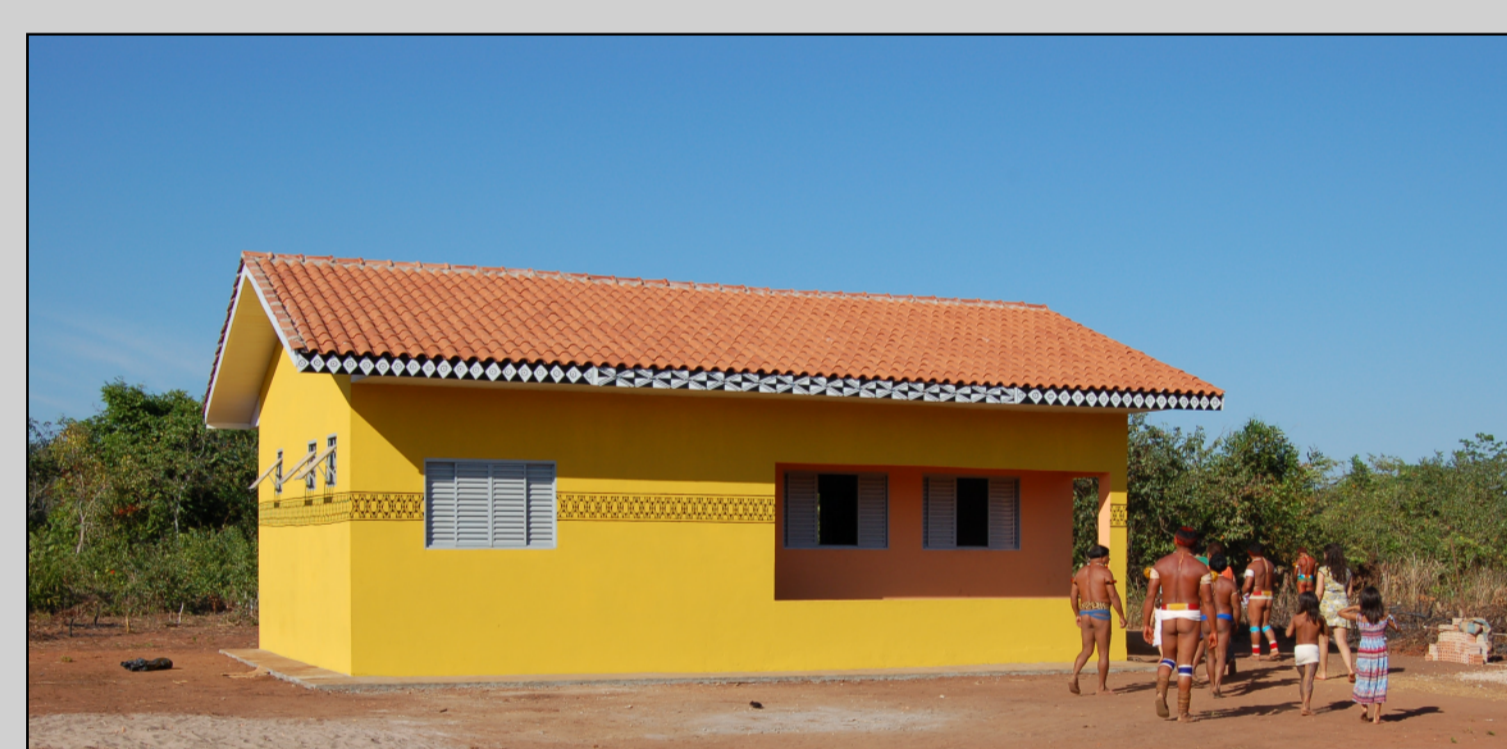
The Documentation Center, Ipatse village (Carlos Fausto, 2007)