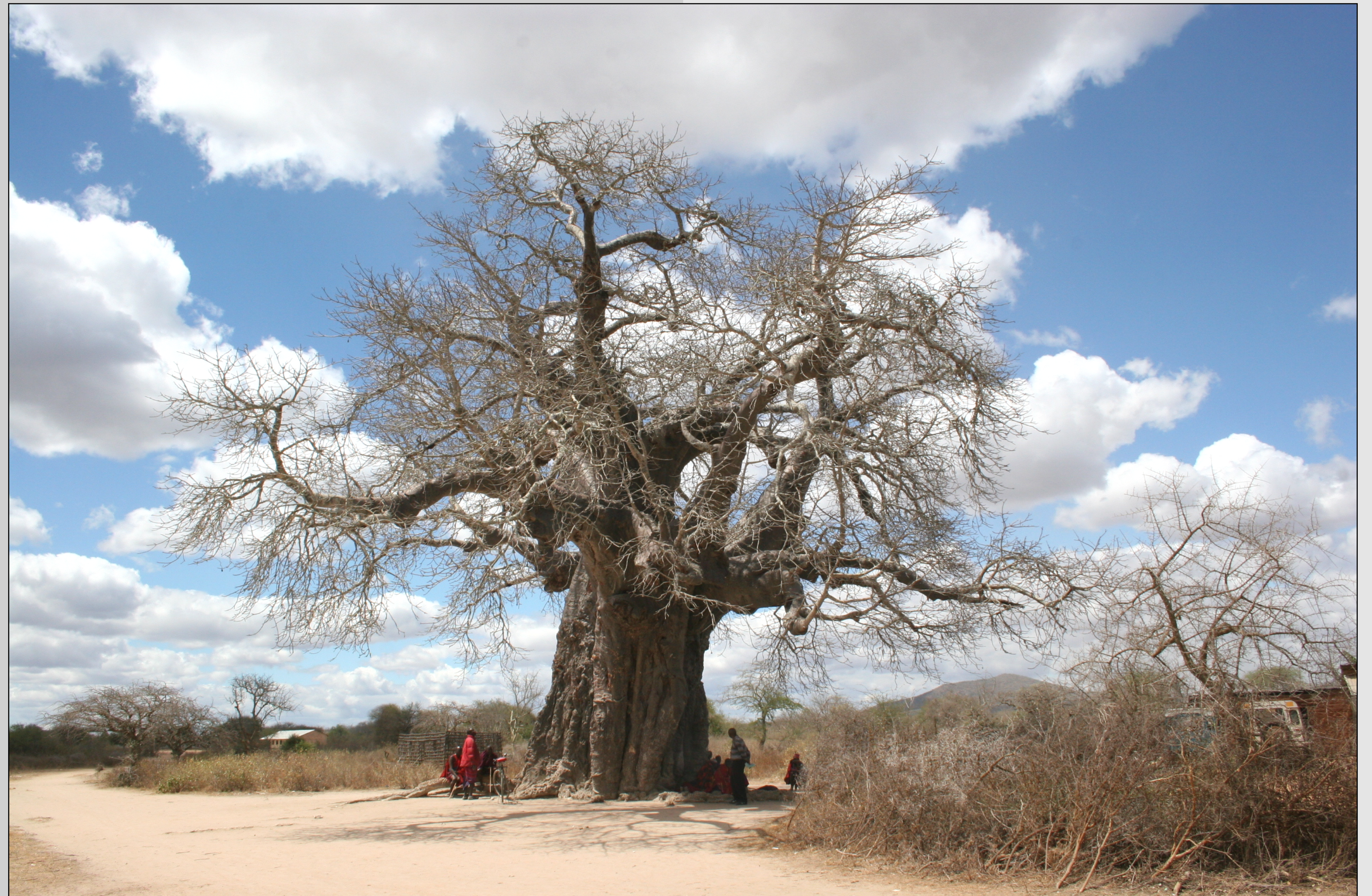
The baobab ( Adansonia digitata , BOMBACACEAE) plays a prominent role in Akie life such as source of honey, which is collected from bees nesting in holes.