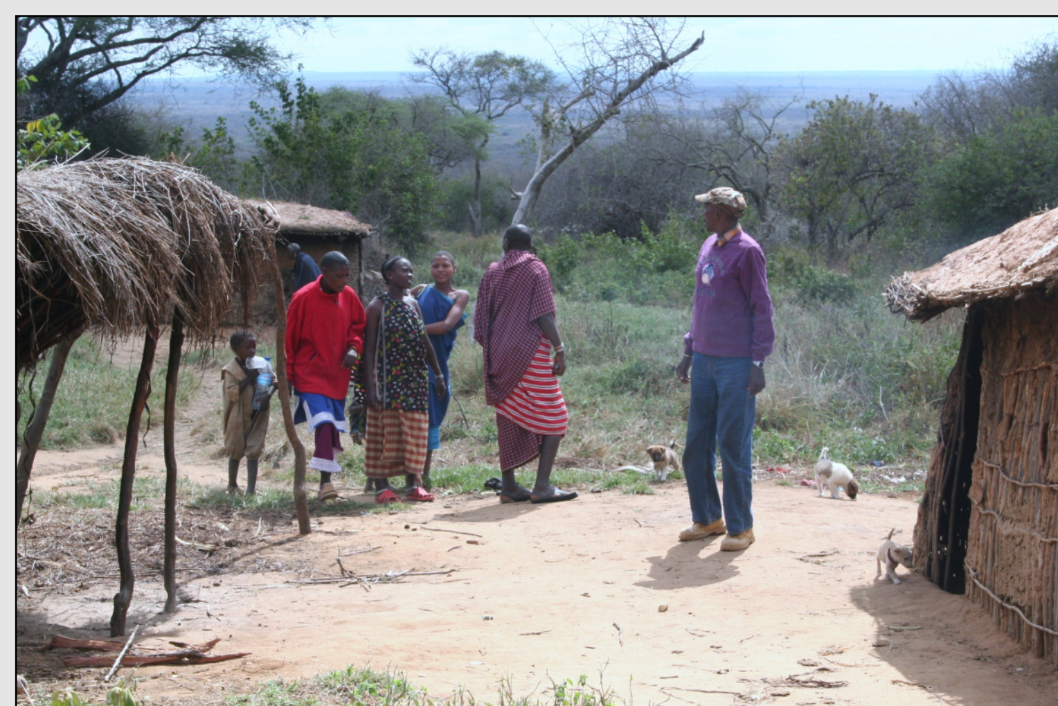
Akie people in Ngababa and the landscape surrounding them

Akie and Okiek belong to the Kalenjin languages of the Southern Nilotic languages ( kalenjin in Akie means 'I speak'). Akie is still actively spoken and the medium of daily communication in the Gito (Losikito) village (Kilindi District, close to Kiberashi, approx. 40 adults plus a not counted number of children, evidencing the intergenerational language transfer) and in Kitwei A (Simanjiro District) approx. 60 speakers have been traced. No details are known for the Okiek language the distribution of which is not a focus for this work.