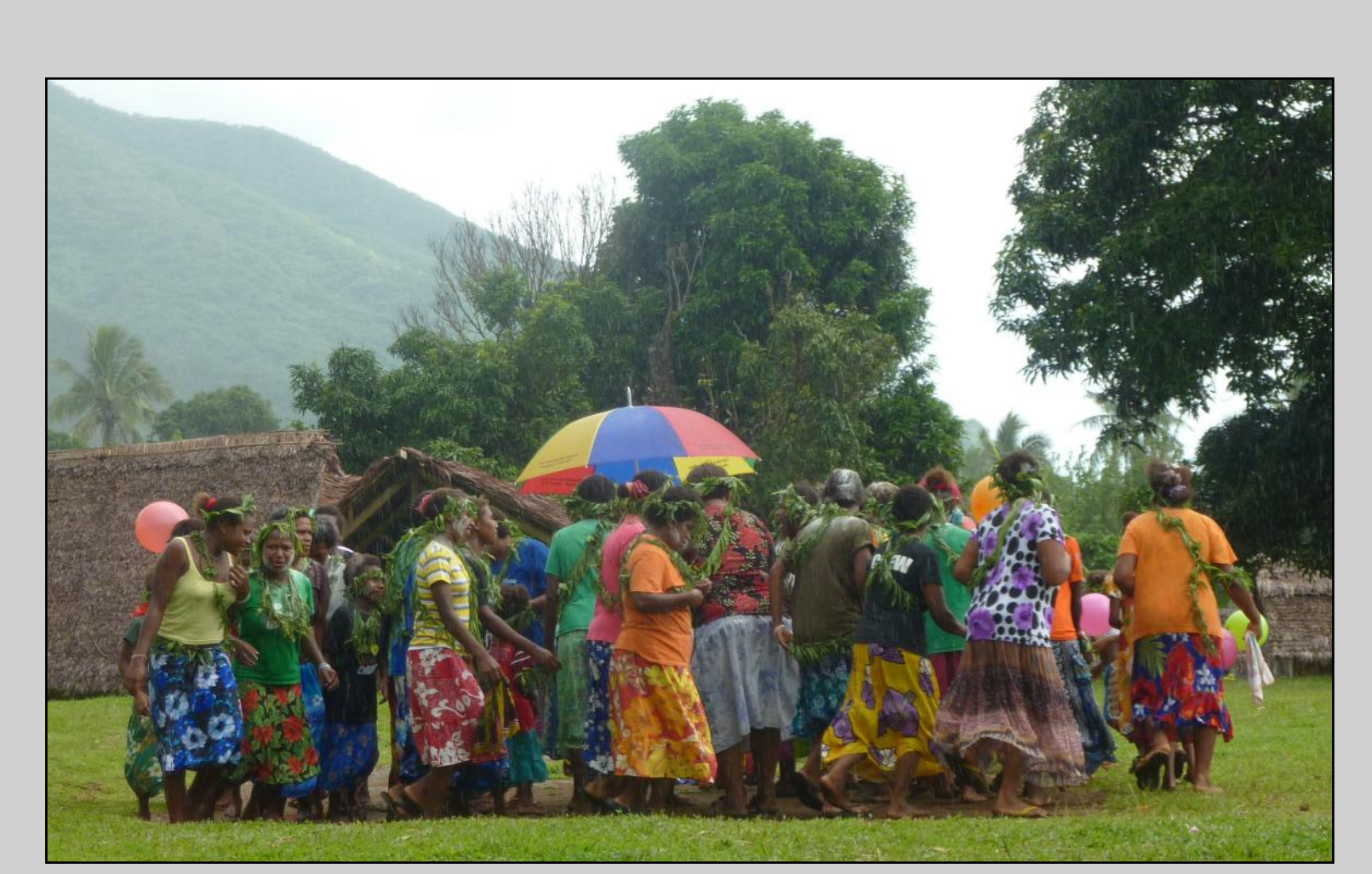
Women of Vurës dancing the lian at Vētuboso

We have produced a total of four DVDs on three of these topics that have been distributed in the speech communities and made accessible to a wider public in Vanuatu.