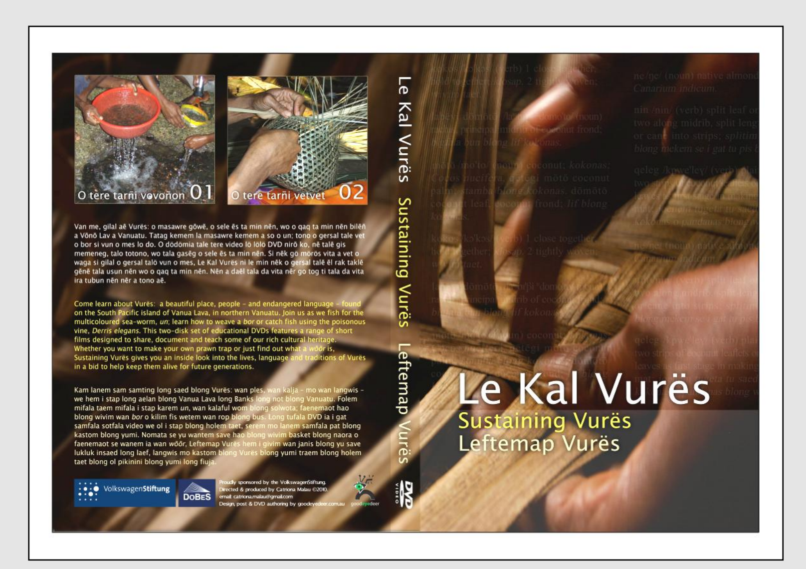
The cover of the Vurës DVD set, which focuses on documentation of weaving and fishing techniques

We have produced a total of four DVDs on three of these topics that have been distributed in the speech communities and made accessible to a wider public in Vanuatu.