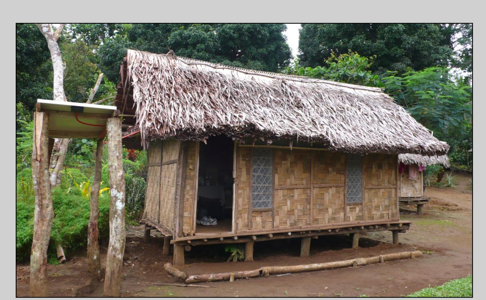
Traditional house with bamboo walling and sago thatch roof, built for project use by members of the Vera'a village community