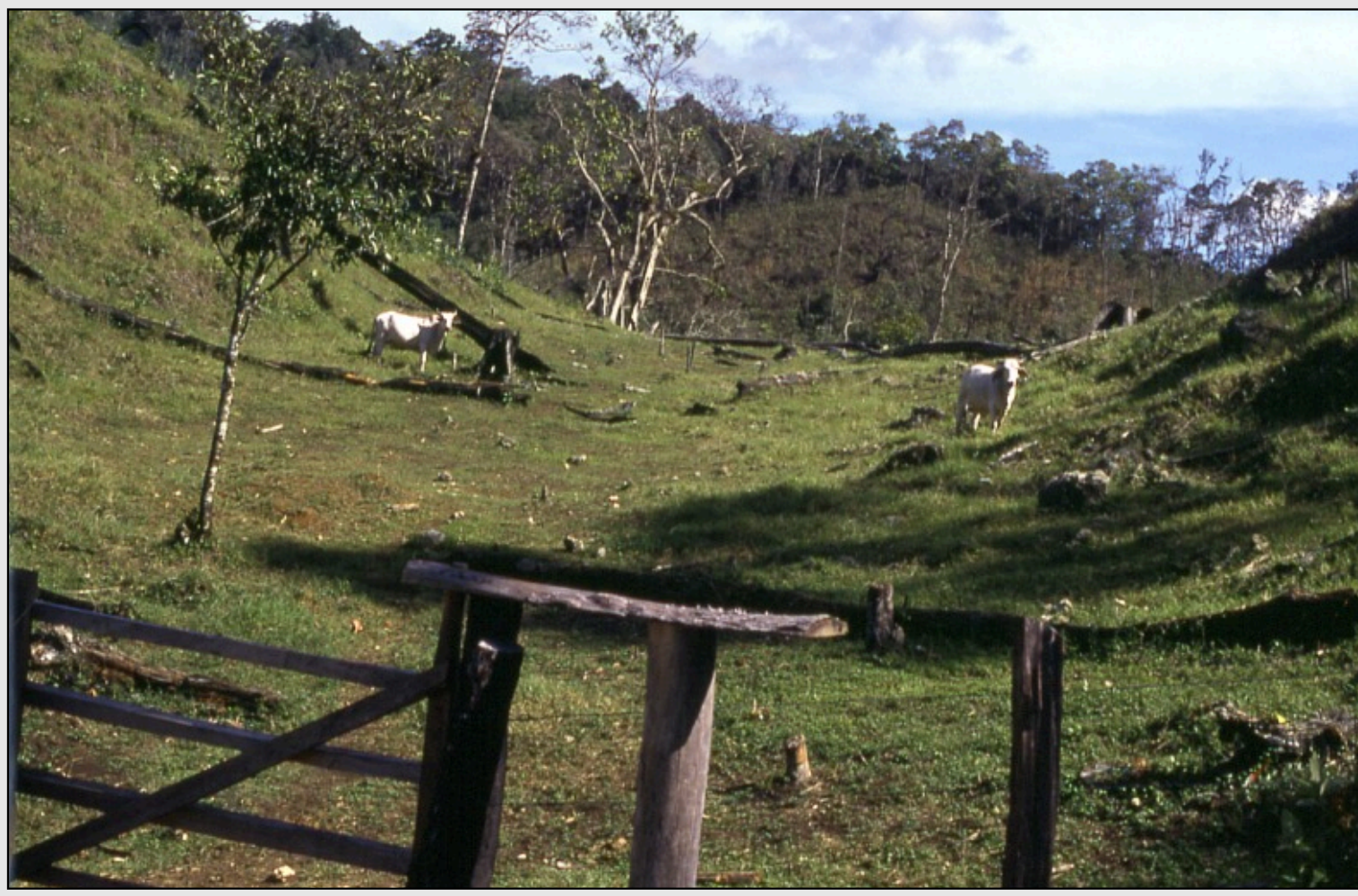
Cattle graze in part of the Selva Lacandona after deforestation.

The term Lacandon is a Spanish corruption of the Maya word Ah-acun-tun-ooob which roughly means "they that set up (and worship) stone". It was a pejorative term used to identify the un-Christianized Mayas in the forest. The people call themselves the Hach Winik "true people".