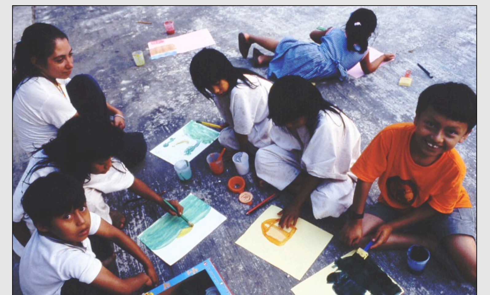
A group of Lacandon children at school

There is a strong, traditional connection between the Lacandones' religious and cultural practices, and their environment. Because of this, deforestation and the influx of homesteaders from other parts of Mexico are factors that have contributed to the decline of the Lacandon culture and, consequently, the richness of its language. In response, the Lacandones have now provided their own "forest ranger" to prevent further exploitation of resources and encroachment by outsiders. However, most men have already stopped farming in the traditional way.