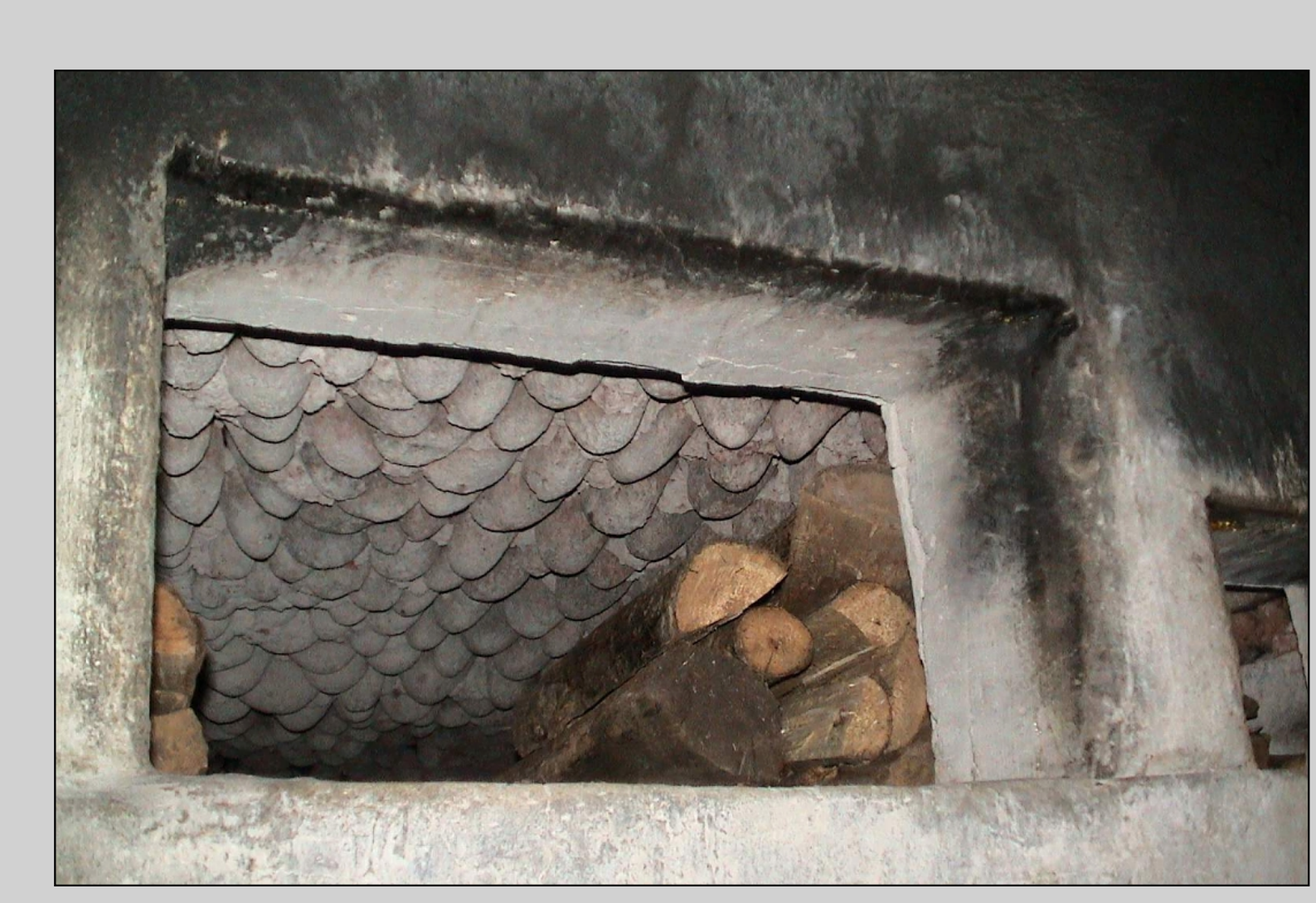
Almost obsolite post-European oven construction with volcanic stones