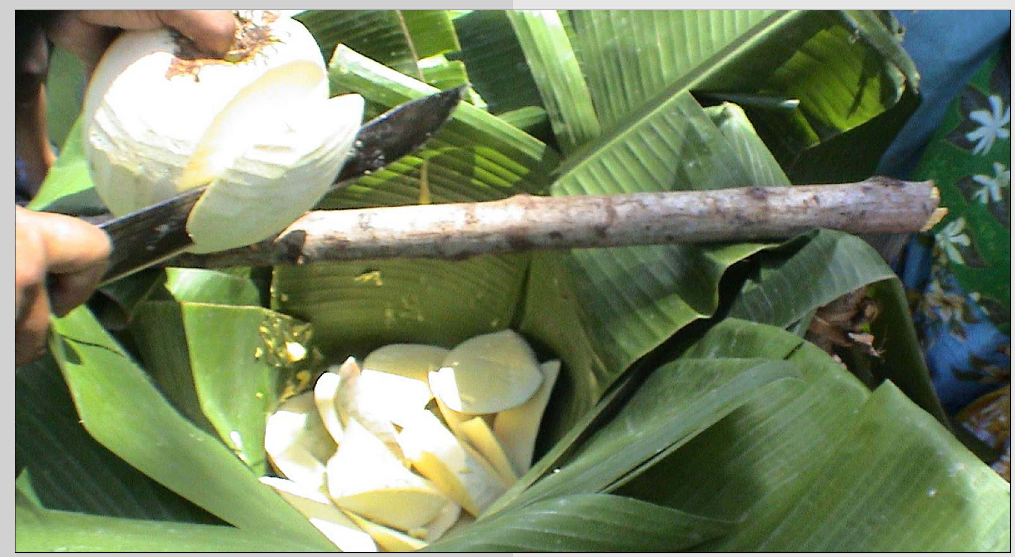
Cutting semi-ripe breadfruit (tata) for ma-production "fermented breadfruit"