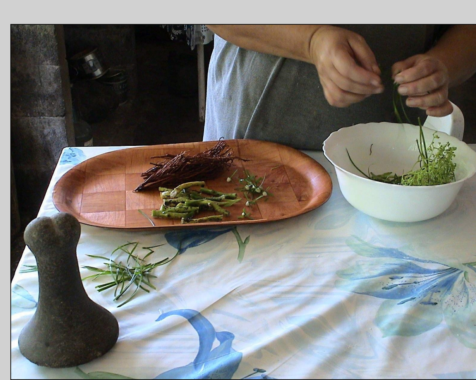
Preparing plant medicine