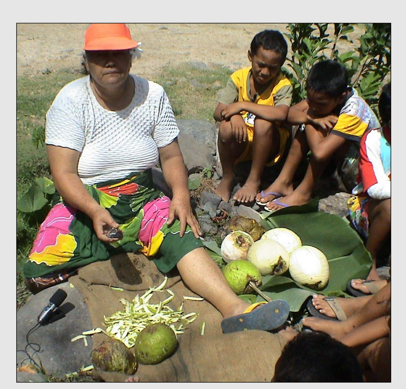
School children watching for the first time the ancient technique of cutting semi-ripe breadfruit with shell tools (veve'e) for ma-production "fermented breadfruit"