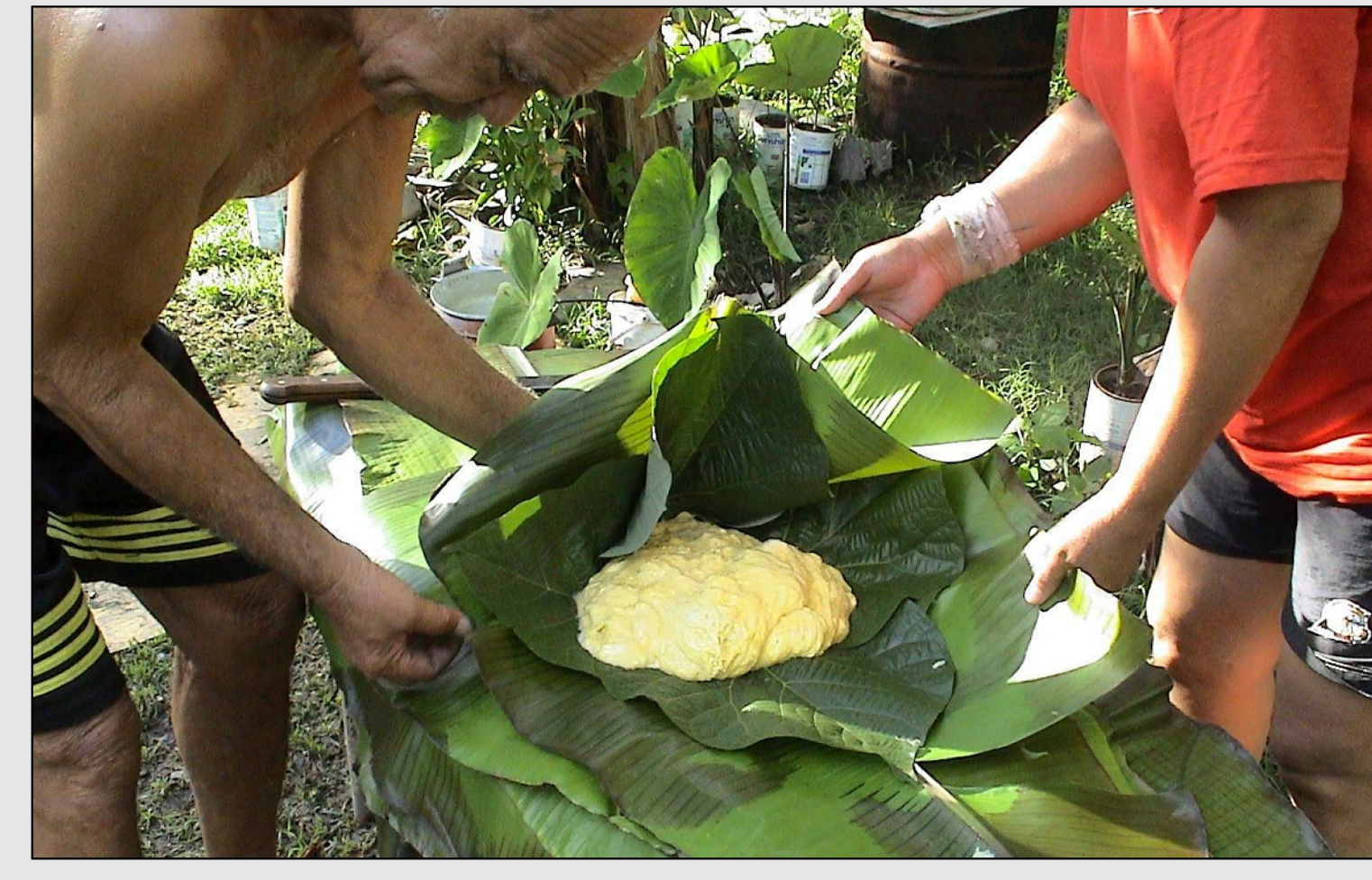
Documenting old cooking techniques: wrapping sweet breadfruit paste in banana leaves