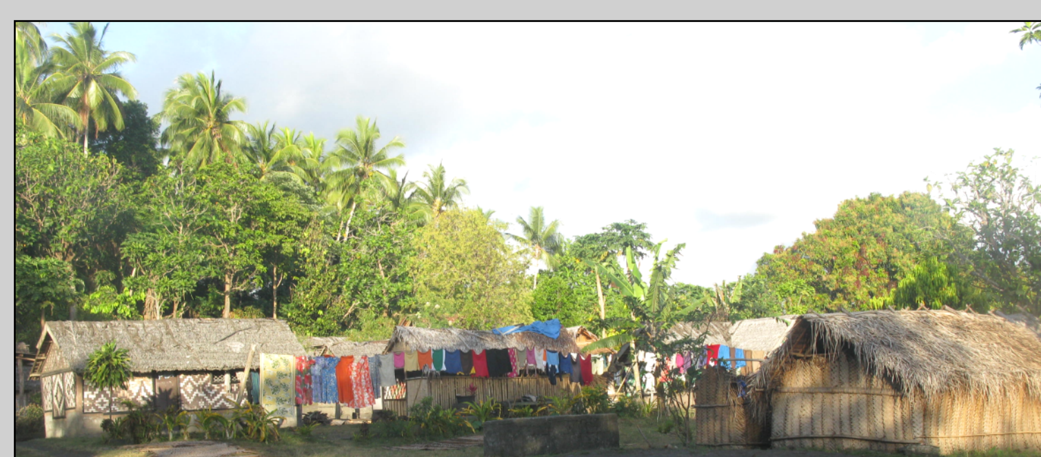
The village of Emyotungan

A great number of recordings have already been transcribed, translated, analyzed and archived, and they are the basis for the grammatical description of Daakaka, which is already completed, and the still preliminary grammar sketches of Dalkalaen and Daakie. We also compiled comprehensive dictionaries of the languages.