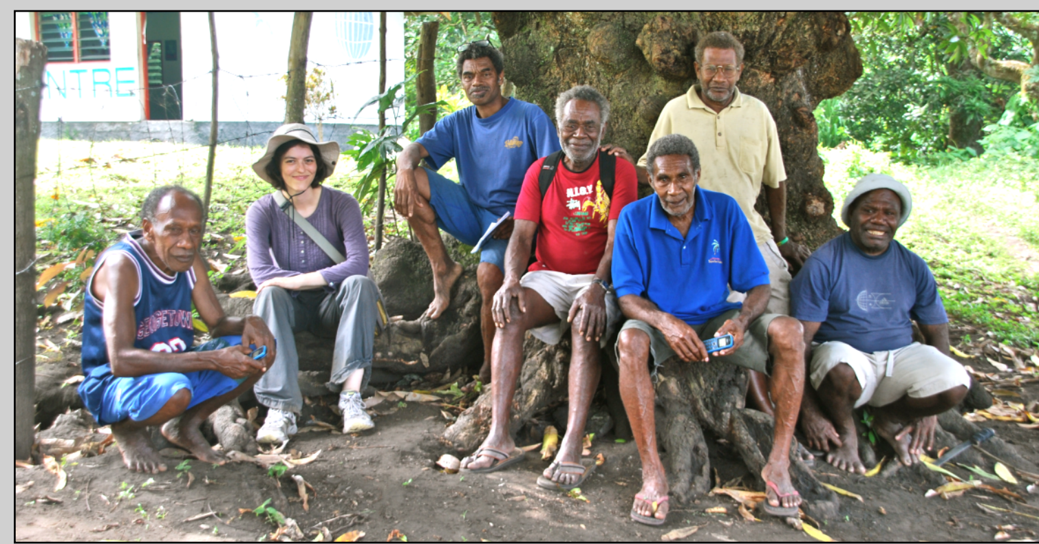
Members of the Daakaka Language Committee

While many properties of the languages are quite typical for the languages of Vanuatu, some of their features are rather exceptional for the region, and others have not been well-described before. These include several aspects of nominal possession, semitransitive verbs and event argument serializations.