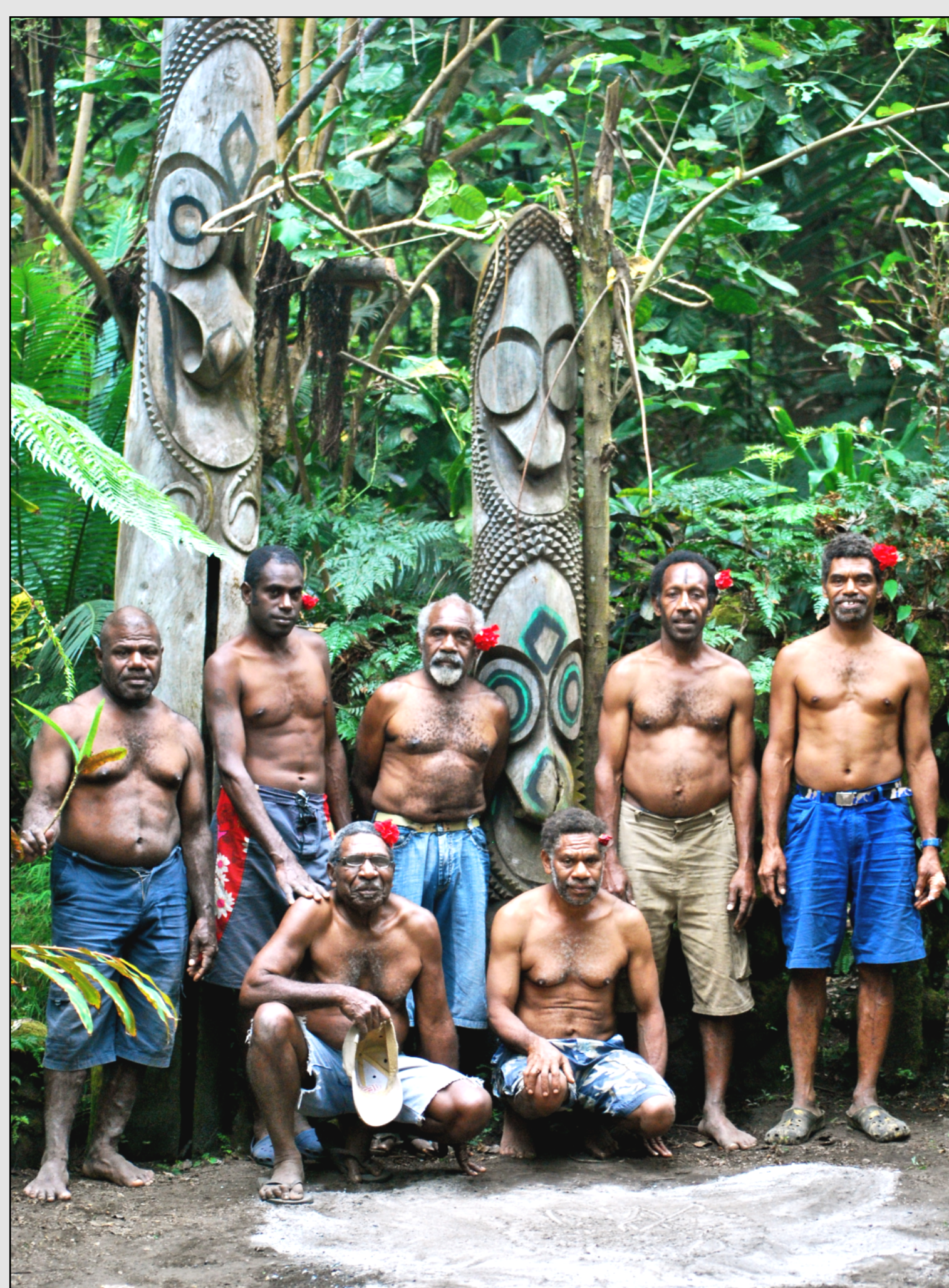
Chiefs from the Daakaka and Dalkalaen regions in the nasara (dancing ground) of Emyotungan before a sand drawing performance

The languages are structurally very similar, but differ clearly in their sound systems and vocabularies.