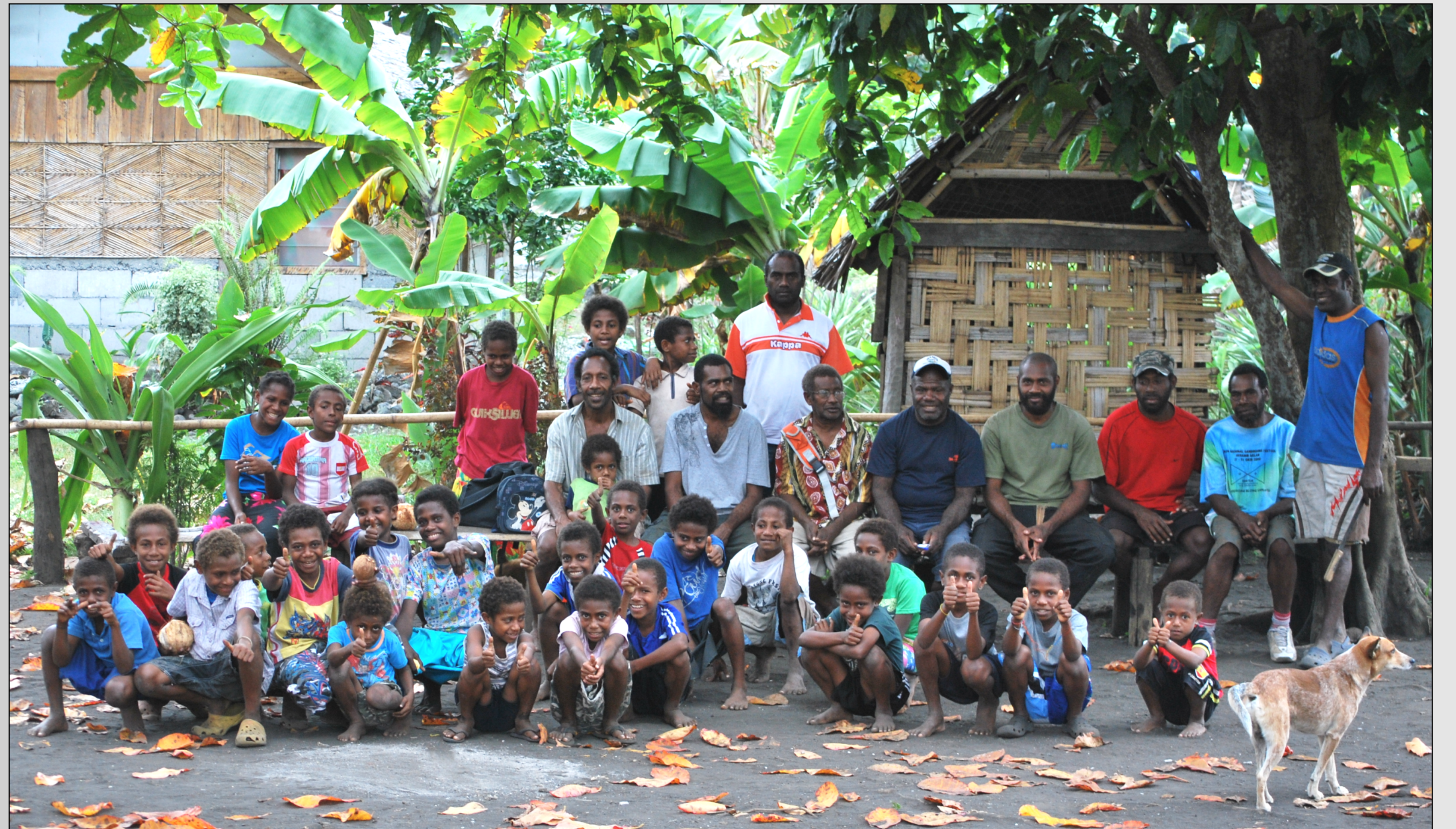
Participants of a mini art festival at Wuro

While many properties of the languages are quite typical for the languages of Vanuatu, some of their features are rather exceptional for the region, and others have not been well-described before. These include several aspects of nominal possession, semitransitive verbs and event argument serializations.