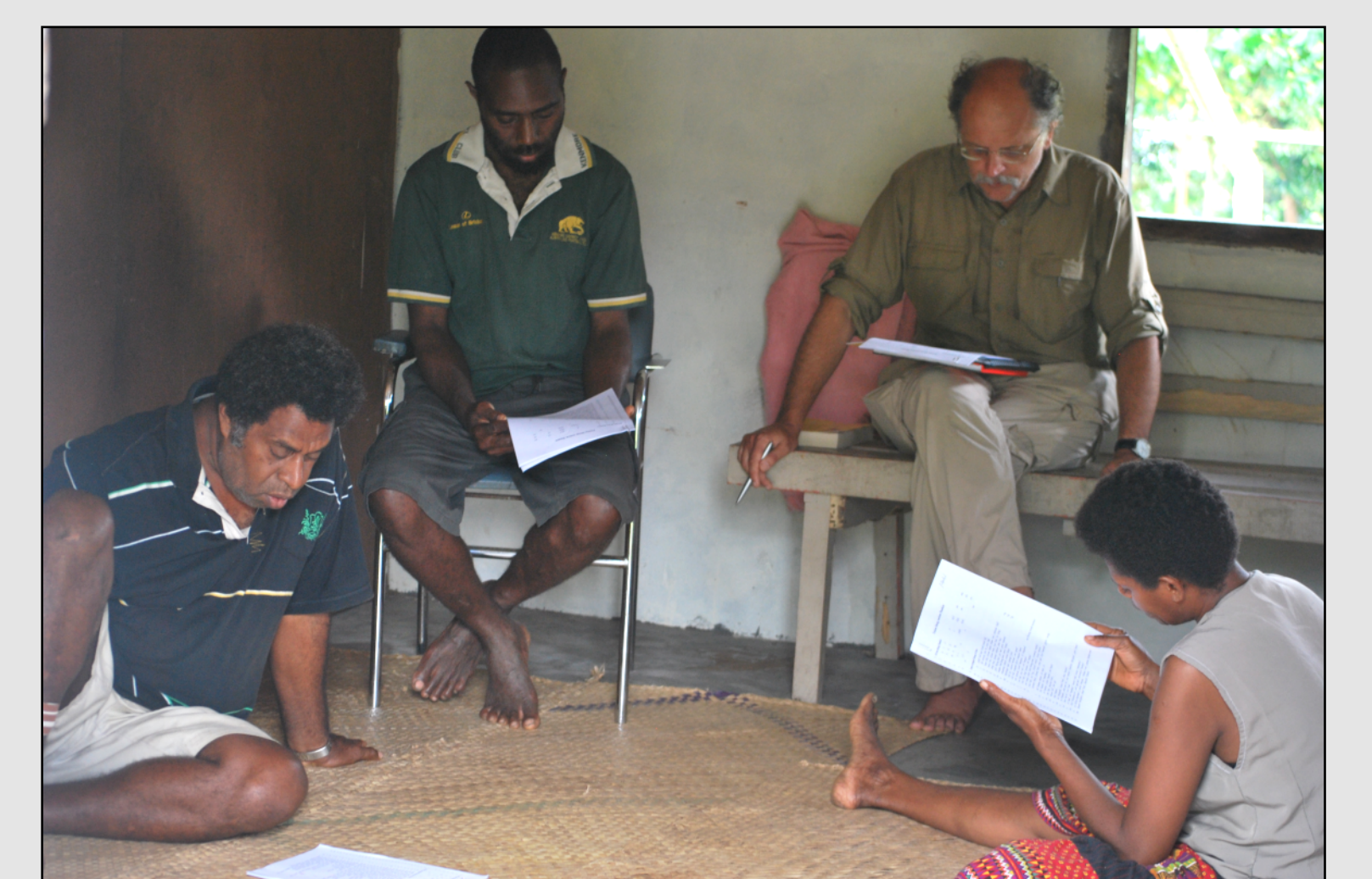
The Daakie Language Committee

The documentation work does not only serve academic purposes, but is also the basis for the development for educational resources for local communities. In particular, we developed orthographies and books for local uses. At the point of writing, one illustrated dictionary each for Daakaka and Dalkalaen and a story book in the two languages have already been produced and distributed, along with DVDs containing video recordings of story-tellings, sand-drawings and traditional children's games. A story book for Daakie, a children's book and a children's bible are nearly complete and will be distributed in 2013.