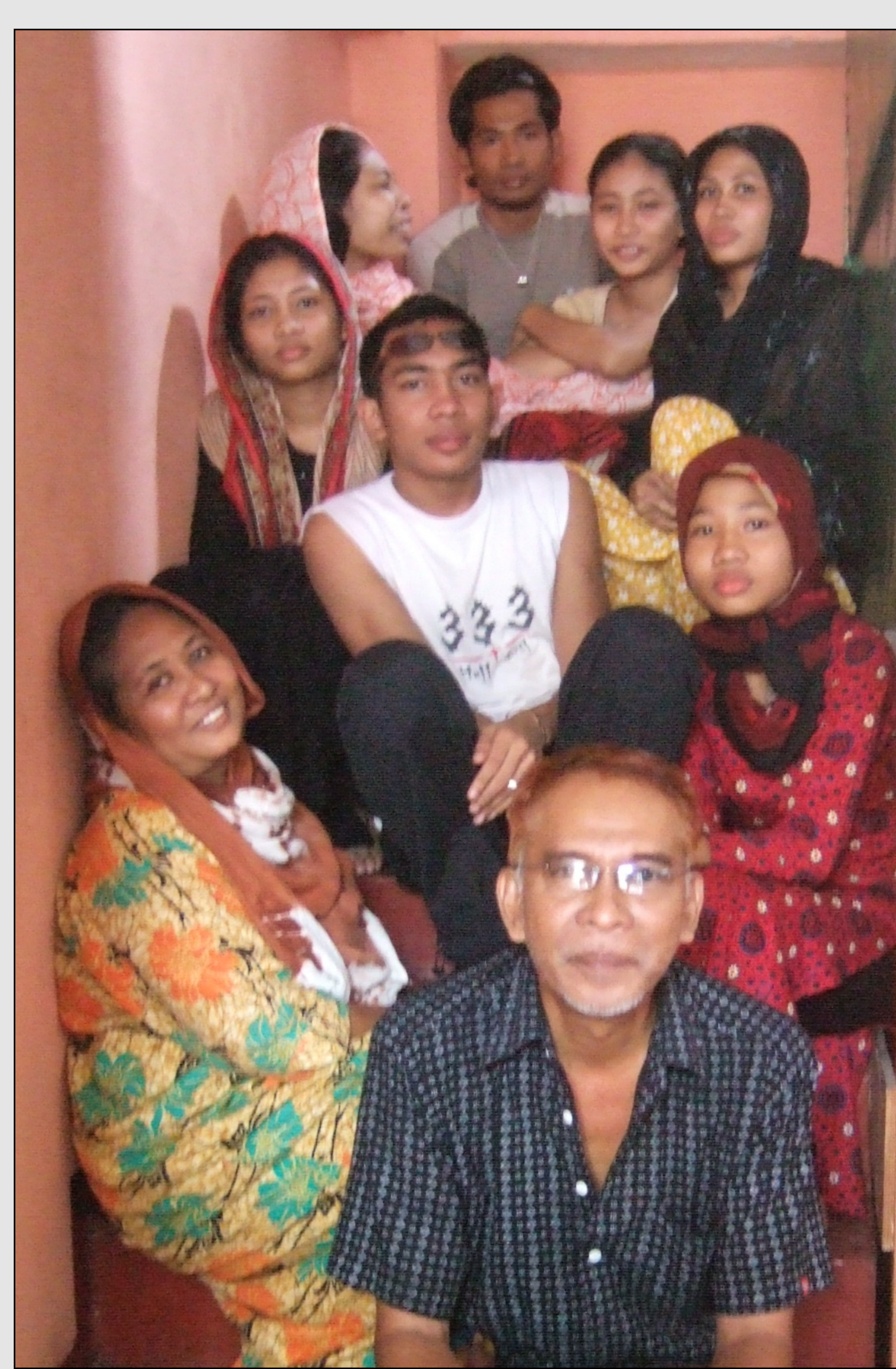
A Sri Lanka Malay family from Slave Island, Colombo.