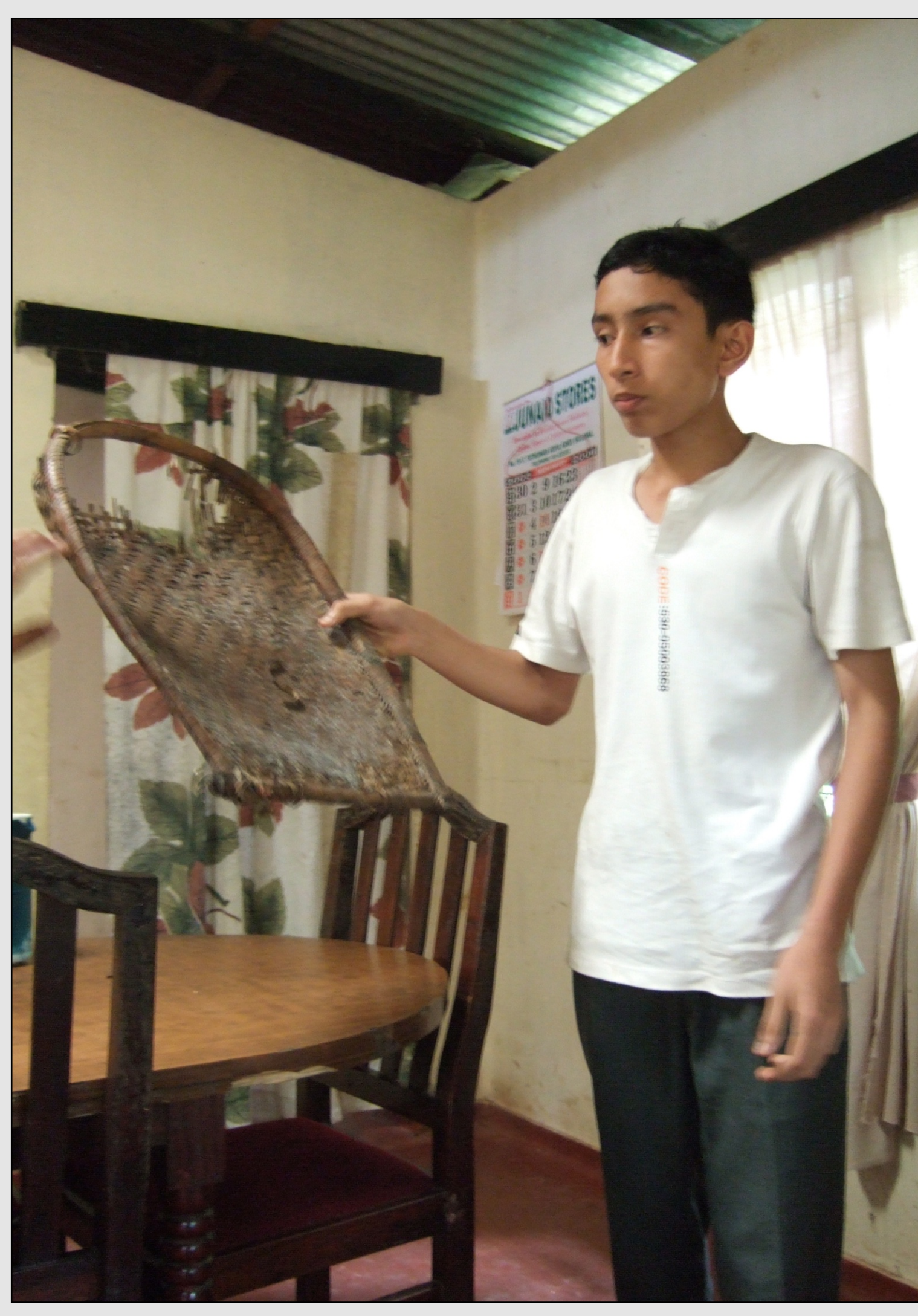
Elicitation involves cultural objects unknown in Europe, here a rice winnow

In distinction to most other Dobes documentation projects, we documented an urban population. The Malays were always close to the colonial powers and resided in barracks close to the colonial centers. Language endangerment is often seen as the languages of globalization encroaching upon the homelands of the 'native' population. Sri Lanka Malay calls this conceptualization into question: without globalization/colonization, the Sri Lanka Malays would not even exist. This being said, English is currently making inroads into all languages of Sri Lanka, especially among the urban populations. Given that the Sri Lanka Malays reside in urban centers, they are more affected by this development than other ethnic groups.