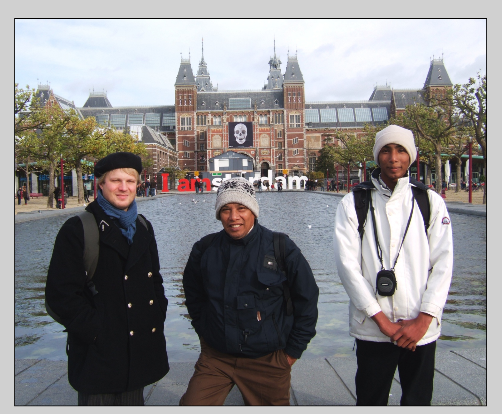
The Sri Lankan civil war led to the 2008 meeting with consultants being held in the Netherlands

The project was scheduled to start in January 2005, but due to the Tsunami on 2004/12/26, the first documentation efforts could only be made in late 2005. The project began during the cease-fire of the Sri Lankan civil war, but hostilities broke out again some time later, which meant that in 2008 the researchers met the Malays in the Netherlands rather than in Sri Lanka. In spite of the worsening security situation, documentation and transcription efforts could be kept up thanks to good collaboration over the Internet.