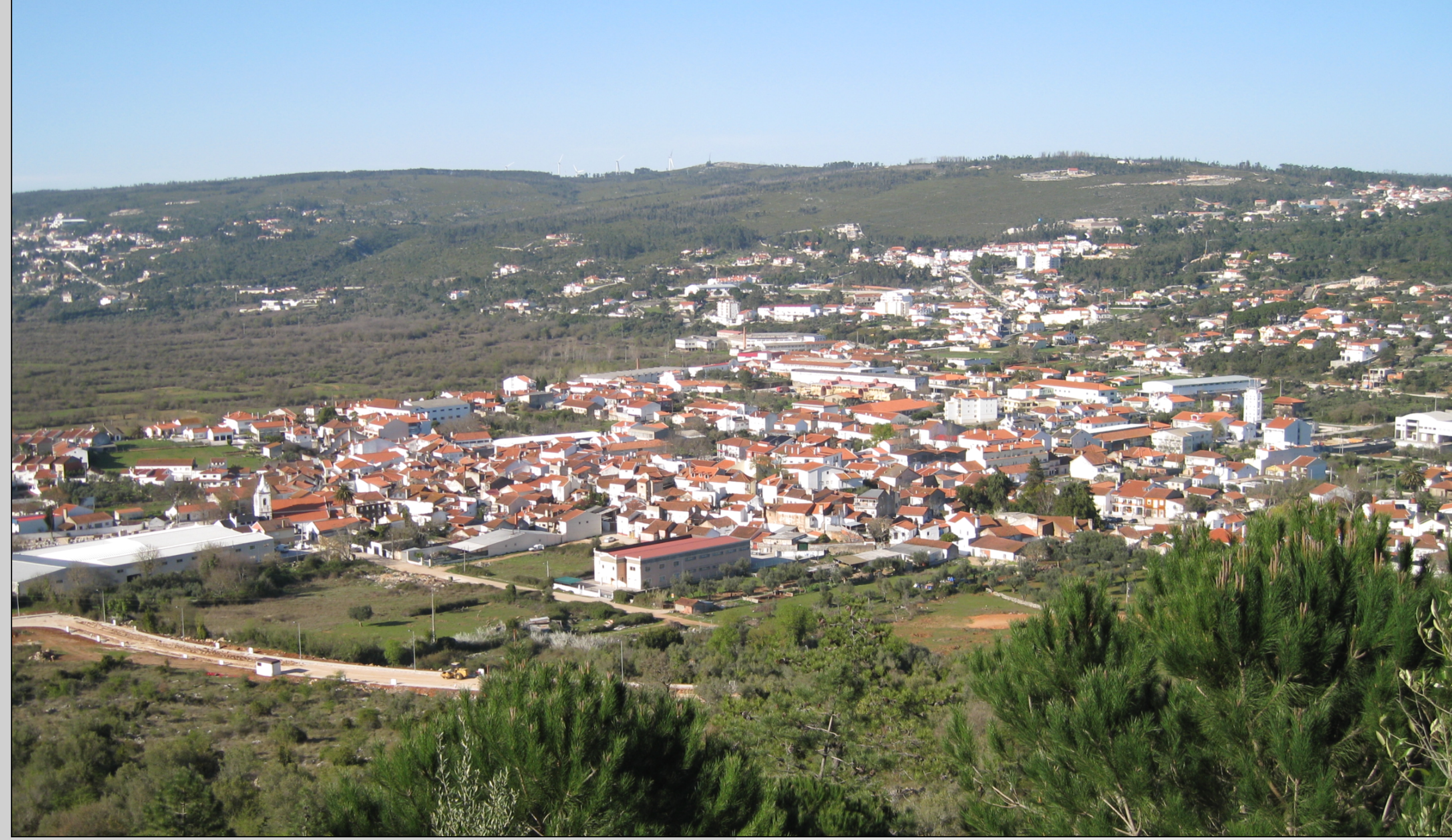
View of Minde from the plateau of Santo António (Photo by Vera Ferreira, 2009)