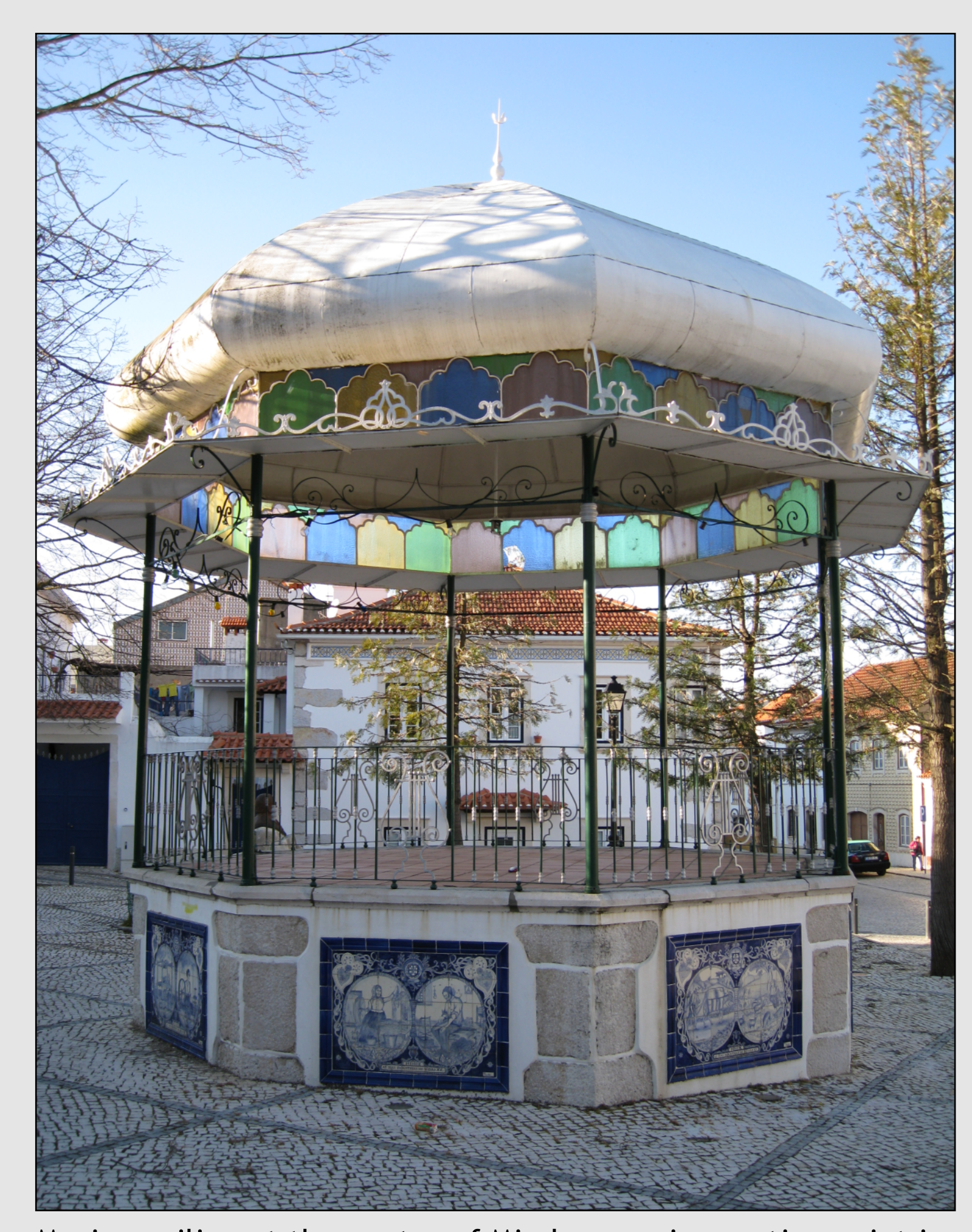
Music pavilion at the center of Minde, a main meeting point in the village

Minderico, also known as Piação and Piação dos Charales do Ninhou, is an Ibero-Romance language spoken in Minde. Minde is a 900-year-old village that belongs to the muncipality of Alcanena, district of Santarém, in Portugal, and lies 115 km north of Lisbon and 240 km south of Oporto. It is geographically isolated: it lies in a close depression between the plateau of Santo António (on the south) and the plateau of São Mamede (on the north), and is surrounded on its west side by a polje (a large flat plain in karst territory that inundates during rainy winters and spring seasons).