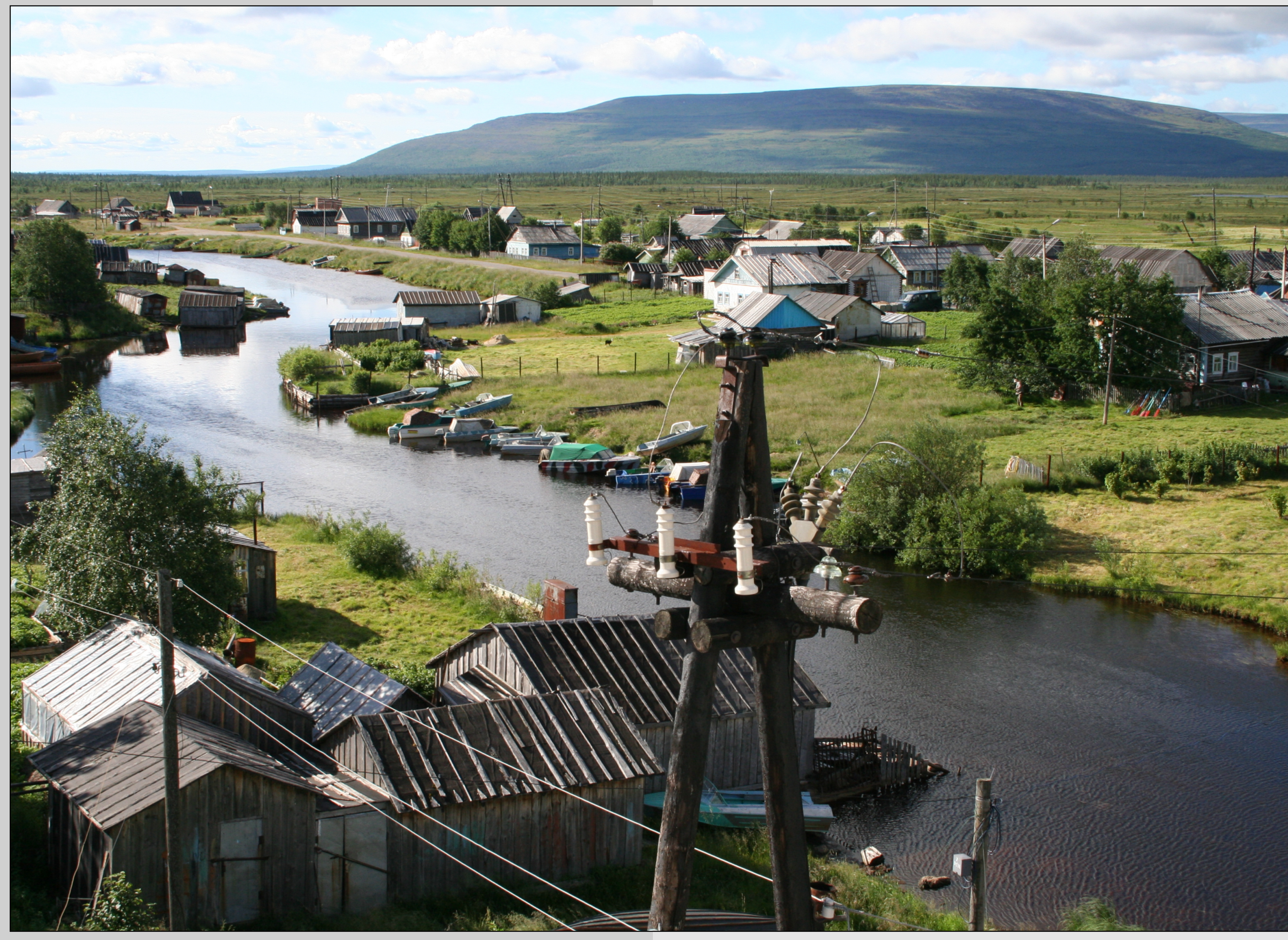
View of the river Virma in the outskirts of Lovozero, in the background the mountain range Lovozerskie Tundry (July 2006)

The four easternmost Sámi languages Ter, Kildin, Akkala and Skolt are spoken on the Kola Peninsula in northwestern Russia. However, the absence of a language environment in which the native Kola Saami varieties are spoken by most people regularly as well as a lack of social motivation for language vitality and development pose a threat to the survival of these languages. In fact only a small fraction of the approximately 1800 ethnic Sámi of Russia fluently speak and understand their mother tongue.