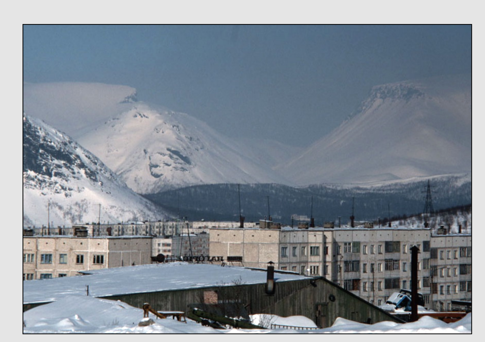
The city of Kirovsk at the foothills of Khibiny mountain range (March 2004,)

The Sámi languages form a branch of the Uralic language family and are related to Finnish and Hungarian, as well as many other languages mostly spoken in Siberia. While the North Sámi language has around 30,000 native speakers, its own orthography, TV and radio programming as well as newspapers and educational institutions, all of the smaller Sámi languages are particularly endangered today due to the dominance of the respective national languages and cultures. As a result, they are frequently not passed on to children as a first language and are in acute danger of disappearing forever.