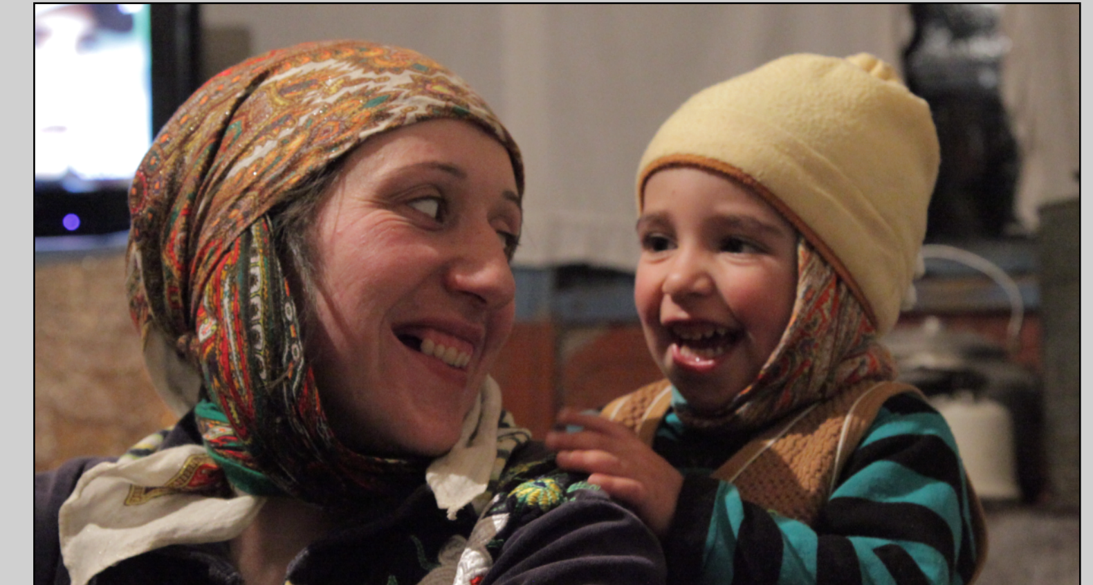
Khinalug village - the highest, most remote and isolated village in Azerbaijan

The project is supervized by Jost Gippert and Wolfgang Schulze. The fieldwork is conducted by Monika Rind-Pawlowski and Tamrika Khvtisiashvili. The target of the project is a comprehensive documentation of the language and its use, including a vast collection of texts through video and audio recordings, the investigation of socio-linguistic issues and cultural characteristics of the speakers, efforts in language revitalization, the grammatical description of the language and the creation of a Khinalug-Azeri-English dictionary.