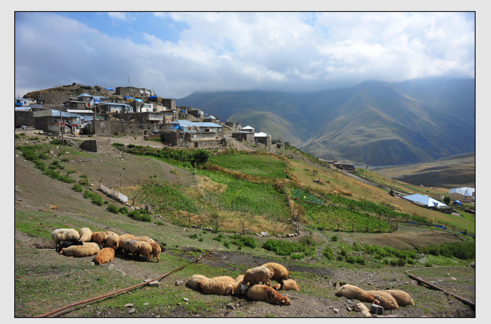
Khinalug village is mostly subsidized by animal herding.