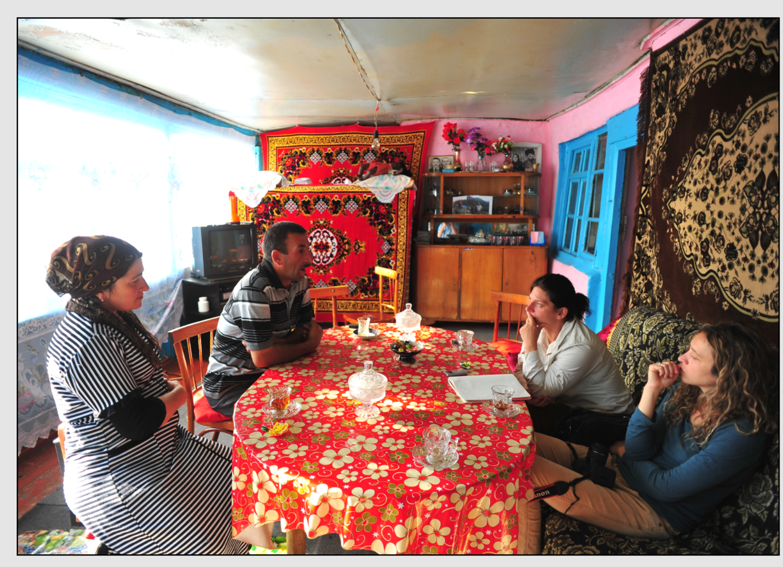
Project team working with the language consultants in the village