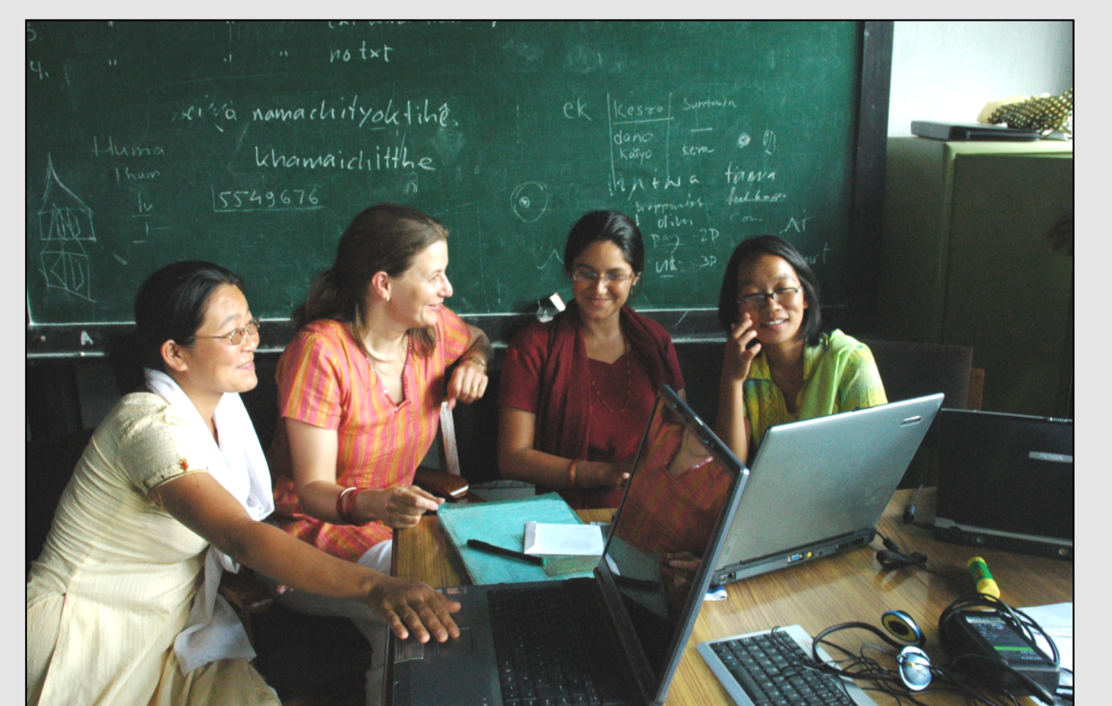
Training of native speakers

CPDP has produced a substantial amount of materials and analyses. 283 hours of Chintang and 39 hours of Puma have been video-recorded. The number of transcribed words is 1,155,630 for Chintang and 152,221 for Puma. Corpora of this size present a milestone for quantitative research on small languages. In addition, CPDP members have published more than 25 papers. So far 12 Master's theses have been written on Chintang and Puma, and 3 PhD theses are in preparation. Research on the two languages and cultures is continued by the Chintang Language Research Programme (University of Zurich, http://www.spw.uzh.ch/clrp/ ) and by the project "Ritual, Space, Mimesis among the Rai of Eastern Nepal" (University of Vienna).