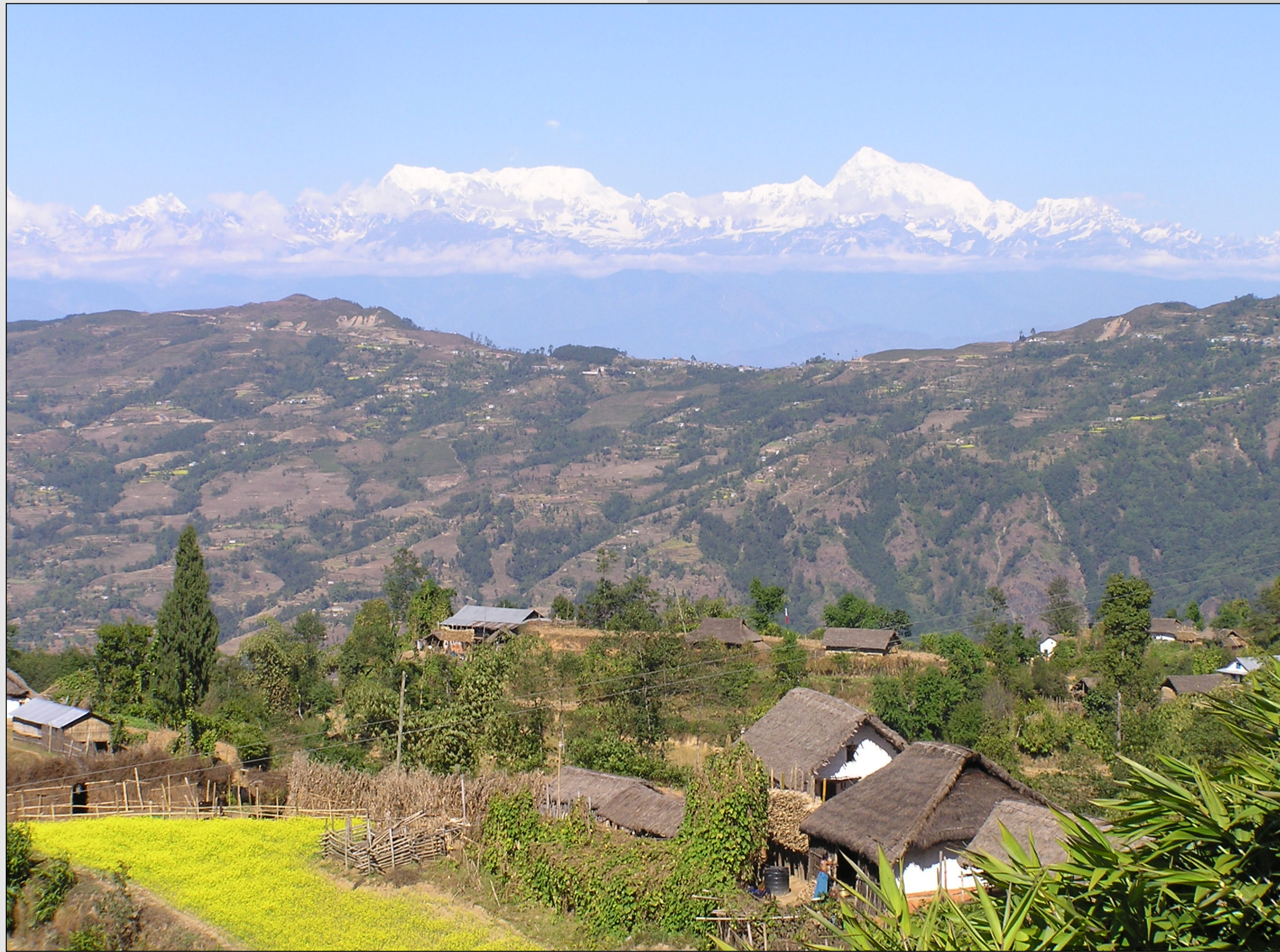
View on fields, houses, and the Himalaya