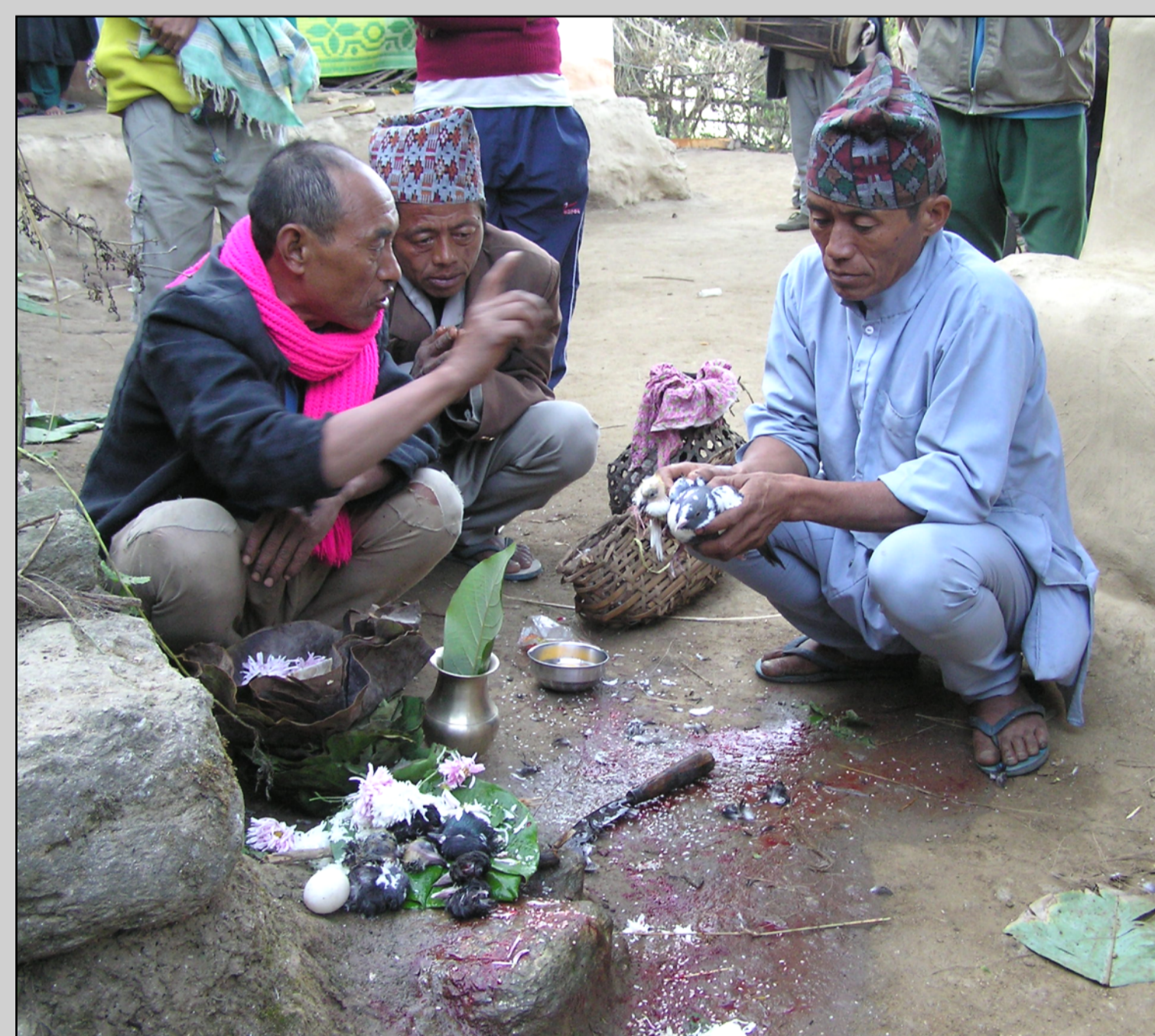
A ritual with bird and flower offerings

age constructions, low referential density, and a wealth of distinctions in spatial deixis. These features have been documented by CPDP, contributing to our knowledge of what is possible in the languages of the world. In order to let the speaker communities benefit from this knowledge, too, dictionaries with appended community grammars have been published and distributed for both Chintang and Puma.