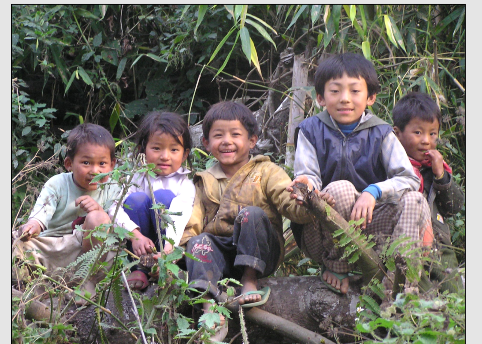
Children in Chintang

Language acquisition, which has only been documented for Chintang, constituted another major area of interest. Research in this field has traditionally been based on large European languages, so small, exotic languages can make an important contribution to achieving a fuller understanding of how children learn to speak. The acquisition of Chintang is also of sociolinguistic interest. Most children in Chintang grow up with more than one mother language, so the roots of language attrition, shift, and death in acquisition can be directly studied here. Another point of interest is that much more freedom of movement and contacts is given to children in Chintang compared to Western societies, so the speech of other children plays a crucial role in language acquisition.