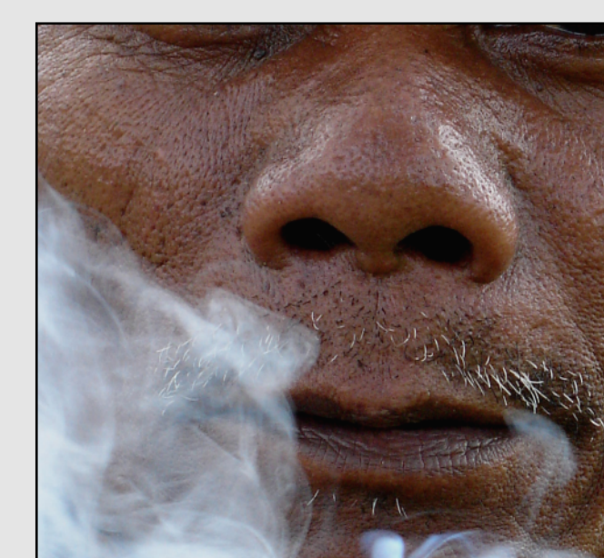
Human relations with the supernatural are mediated largely through smell.

Mainstream theory supposes that the human ability to identify and categorise smells is weak. The Aslianspeaking communities challenge this view, since smell plays a central role in both their lan-