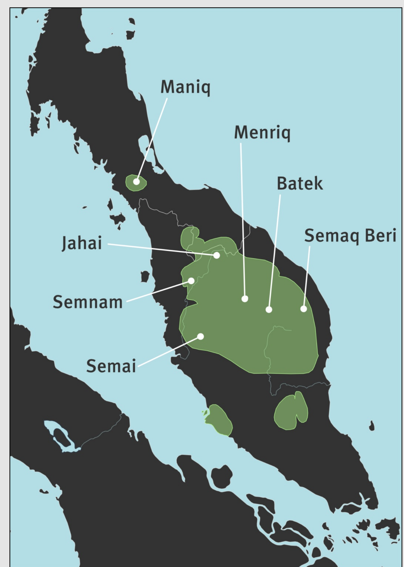
Aslian languages documented by our projects.

Two DOBES projects — Tongues of the Semang and Hunter-gatherer languages in contact — target the endangered Aslian languages. These languages form a branch of the Austroasiatic language family and are spoken by culturally diverse minorities in the Malay Peninsula. Our documentation focuses on those Aslian languages which are spoken by hunter-gatherers, ranging between 26 and 1,000 people. We also carry out surveys in order to identify the current endangerment status of Aslian varieties. The results serve to inform future directions in efforts to document Aslian languages.