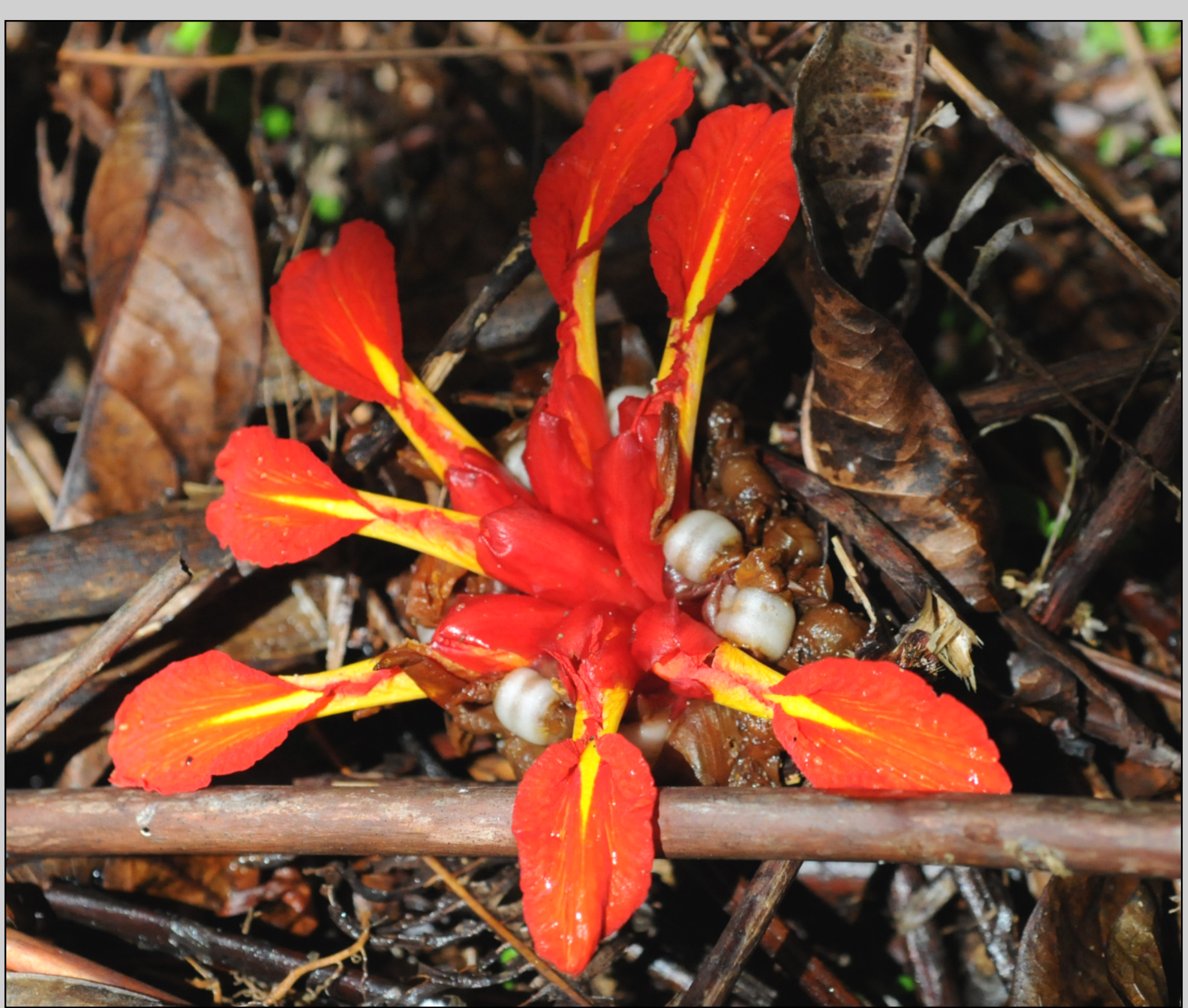
A wild ginger flower (Etlingera littoralis).

Project researcher Ewelina Wnuk investigates indigenous ethnobiological knowledge of the Maniq, foragers of southernmost Thailand, with a focus on the sensory language used in descriptions of plants and animals. The intimate familiarity with wildlife is reflected not only in the number of recognized species, but also in a remarkably rich linguistic repertoire employed when talking about their smells, colours and patterns, e.g. kameh 'to stink (of a millipede)', talan 'to be red (of ripe fruit)', cawãc 'to be striped lengthwise'.