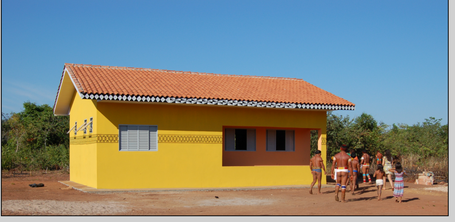
The Documentation Center, Ipatse village (Carlos Fausto, 2007)

tion and Catalogue. Rio de Janeiro: Museu do Índio - Funai, 2008.