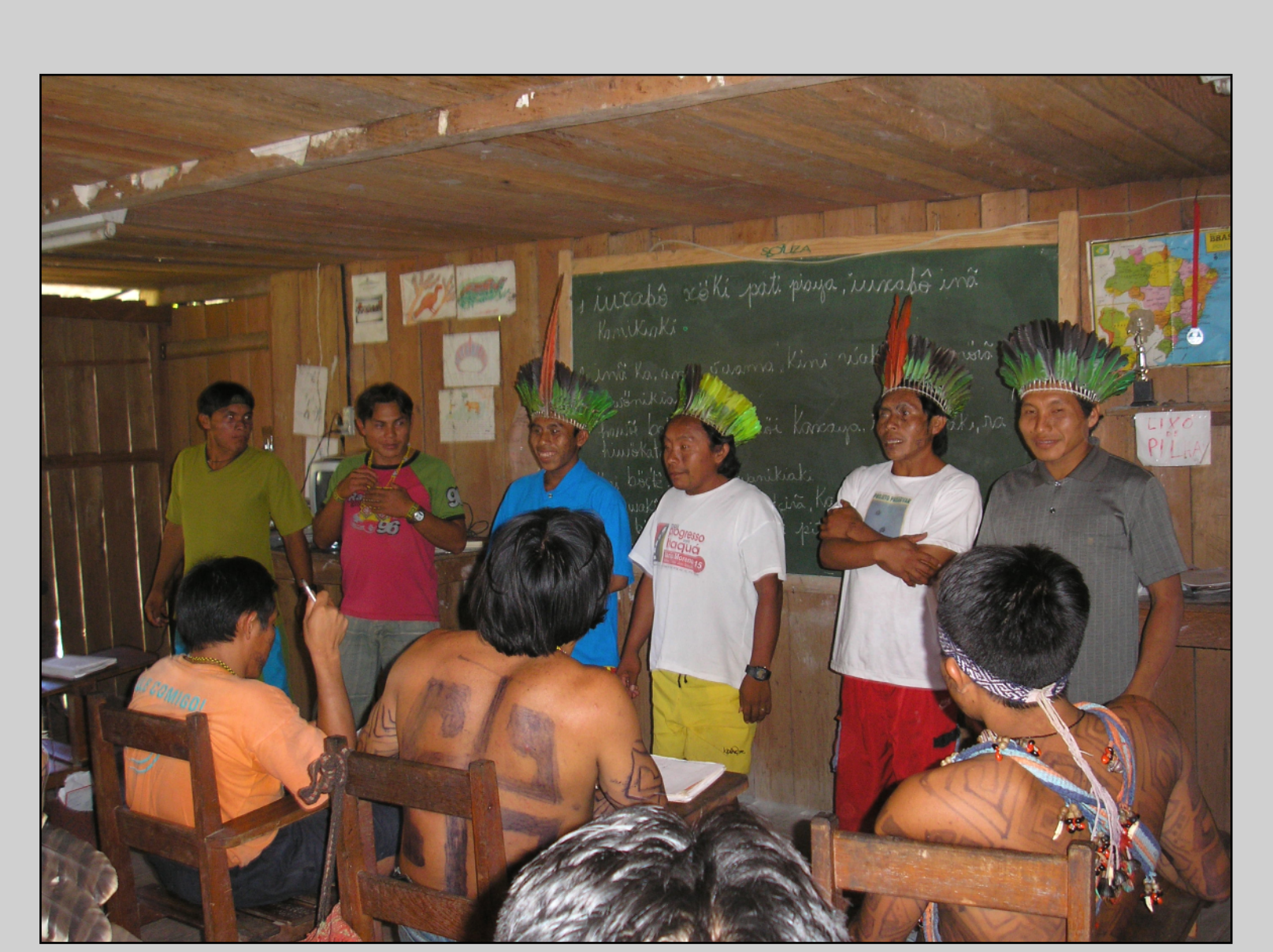
Workshop participants perform ritual chanting (Mucuripe/Brazil 2006)