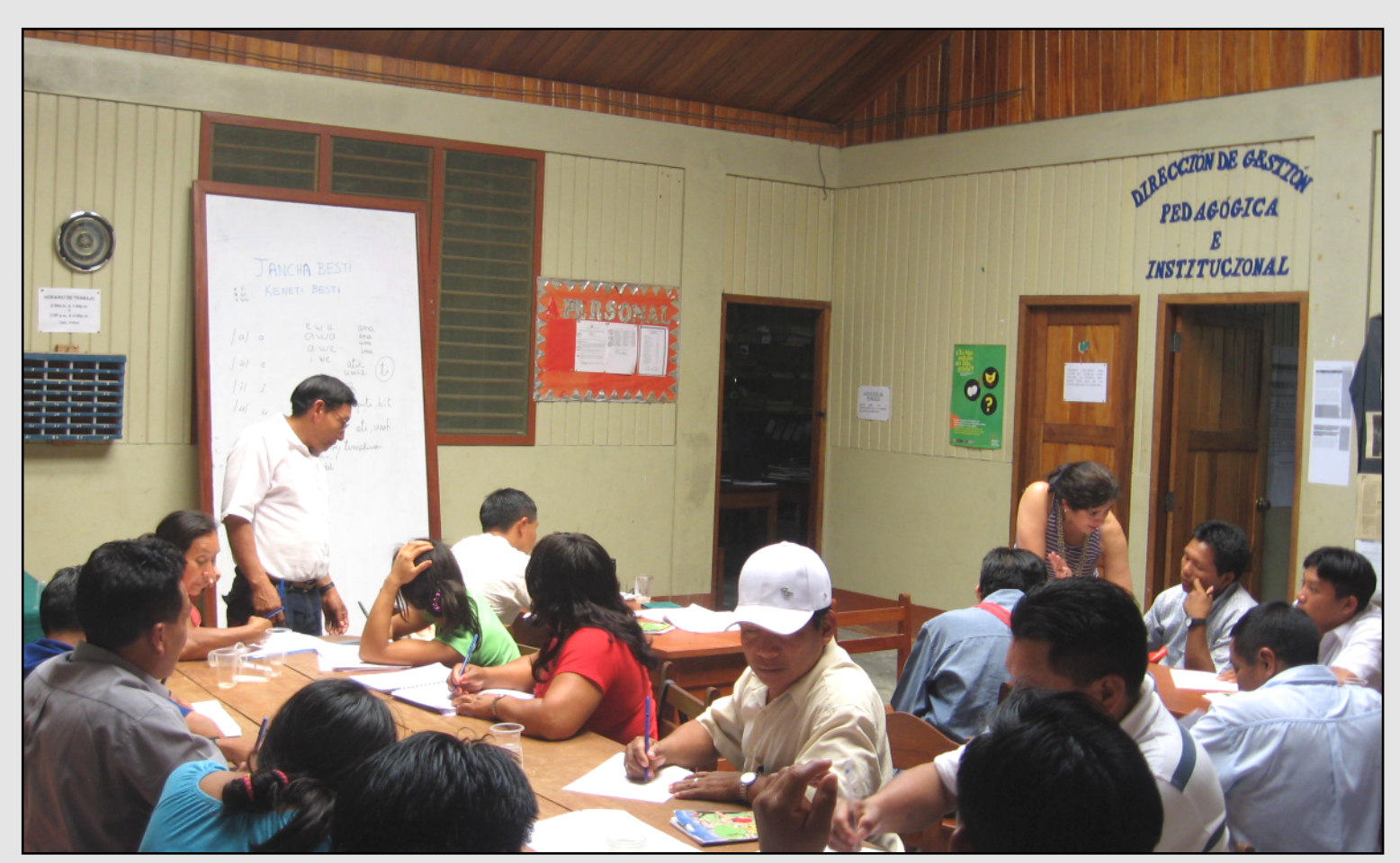
Bilingual teachers from various villages along the river Purus participate in a workshop on orthography development (Puerto Esperanza/Peru 2010)

Since the 1970s many Peruvian Cashinahuas have moved downriver, populating the Brazilian side of the river Purus. A substantial migration to towns can be currently observed in both countries.