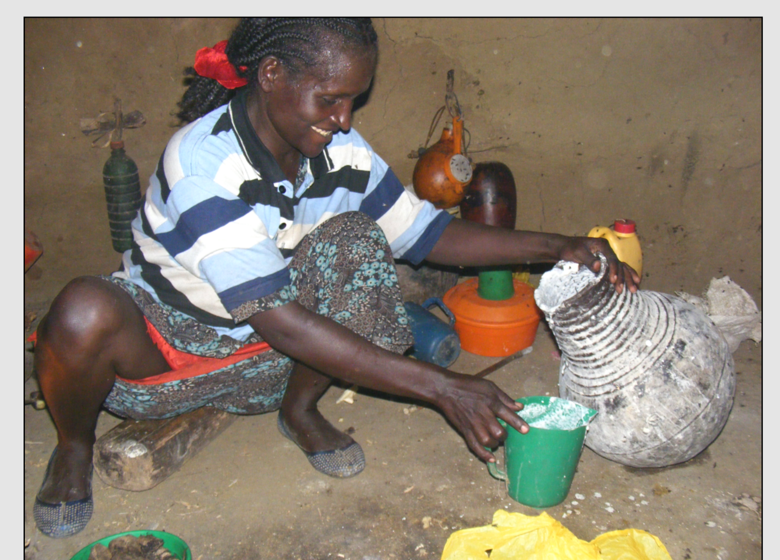
Bayso woman pouring liquid dough