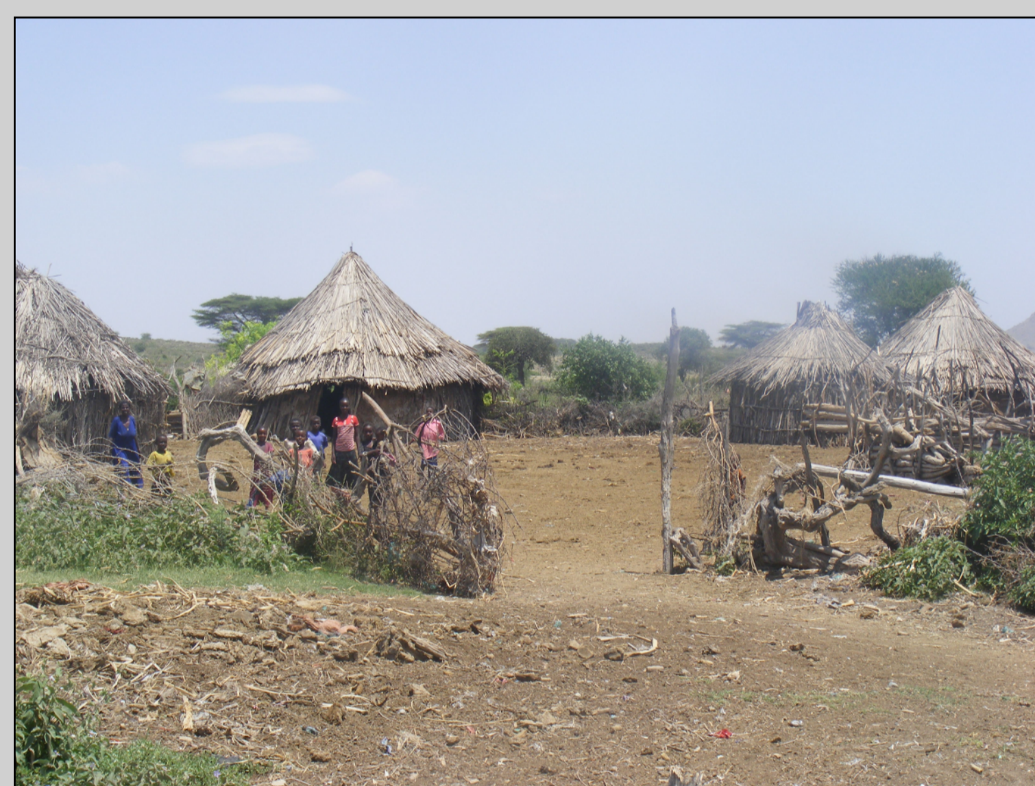
Bayso compound (with the typical distribution of the houses around the cattle space)

For both languages the project aims at the archiving of rich textual, audiovisual and lexical corpora. The documentary material will be accompanied by edited material such as grammatical sketches, dictionaries, anthropological and sociolinguistic profiles and material produced by the speech communities for language promotion and maintenance.