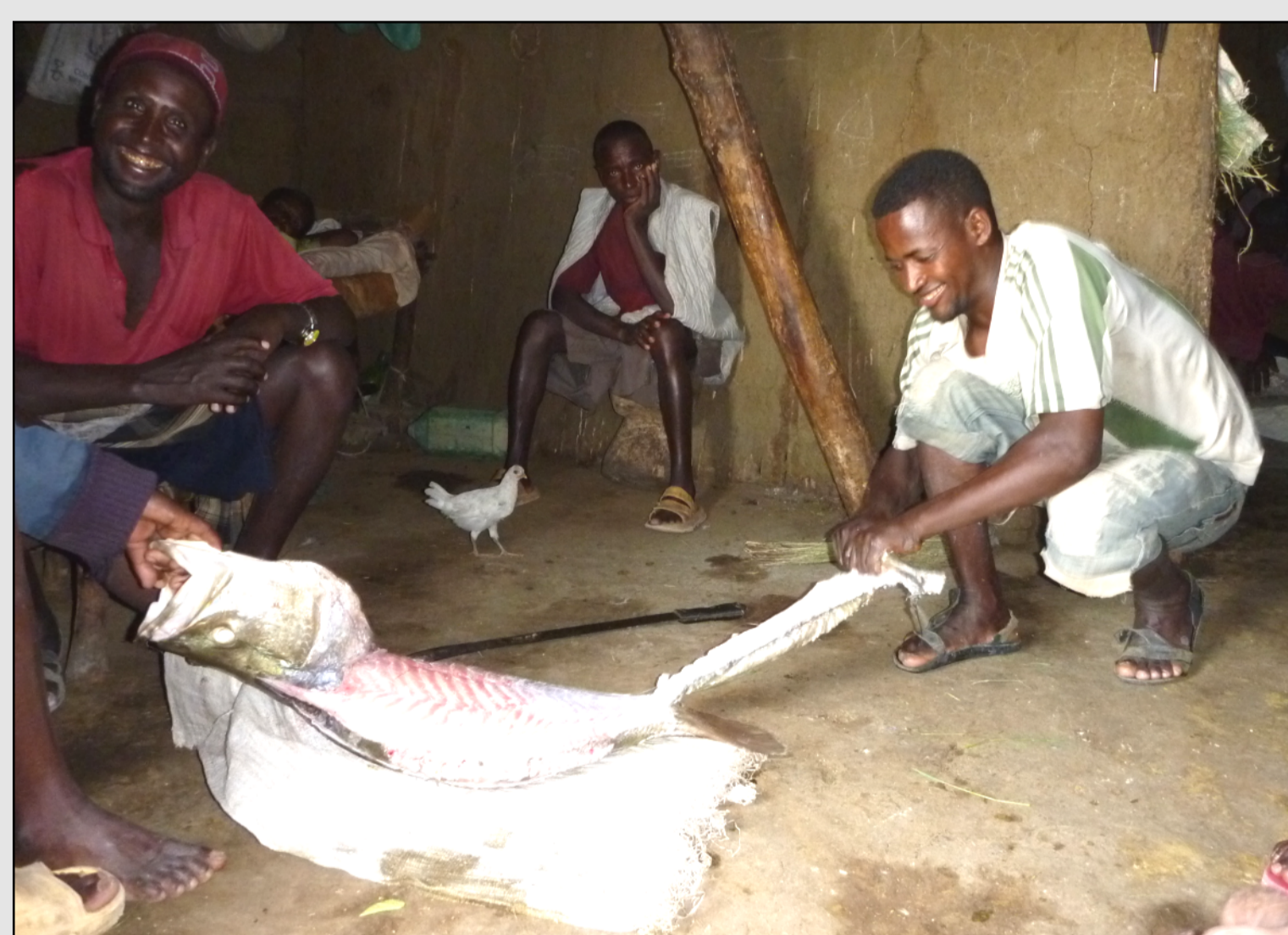
Preparing fish (Nile Perch) in a Haro house

Both the Bayso and Haro have diversified their economy towards weaving, fishing and trading by adapting to their lacustrine habitat of Lake Abaya. Fishing is the most practiced and lucrative activity. The two peoples master the art of using and building rafts of different dimensions. The bigger and most typical model is the Wollaabo (Bayso term, Zepa in Haro), which is characterised by a high front tip and a flat long queue.