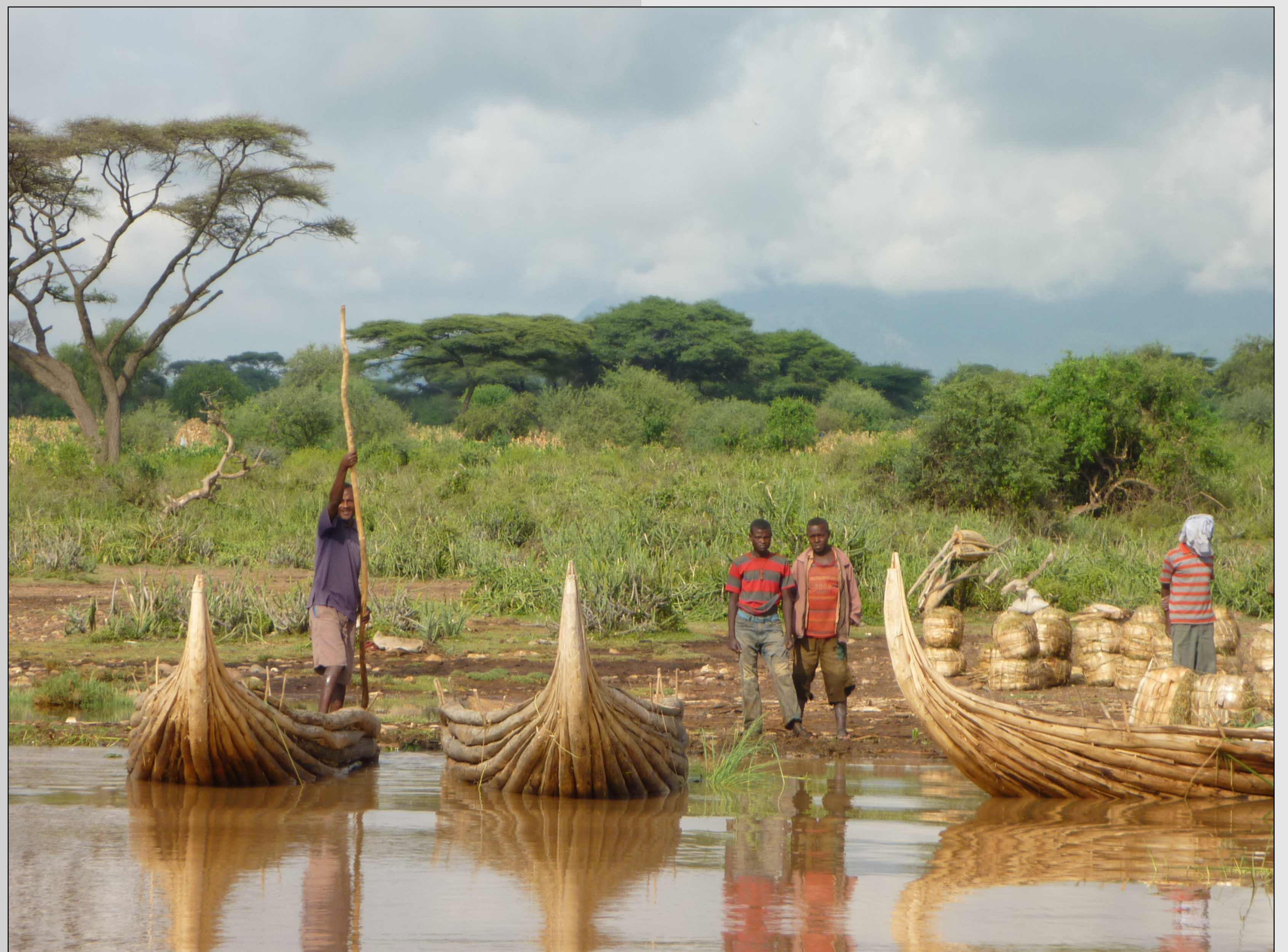
Traditional Zepa boats (Haro term, Woollabo in Bayso) on the coast in Alge

Bayso and Haro are first languages spoken at home. Nevertheless, the low population number, the community-internal use of these languages and Bayso's and Haro's proficiency in languages surrounding them are likely to negatively affect the speech habits of the two communities in the future. In the sphere of trade contacts multilingualism in Guji Oromo, Wolayta, Gamo and Amharic has developed. Amharic is also the language of administration and primary education. The Haro speak also Bayso and the other lacustrine East Omoto language Get'ame. Recently, some Bayso started to learn Haro. Due to the rise of water level and the lack of fertile land in Gidicho, many Haro and Bayso have been forced to migrate to the shores of Lake Abaya and live close to urban areas.