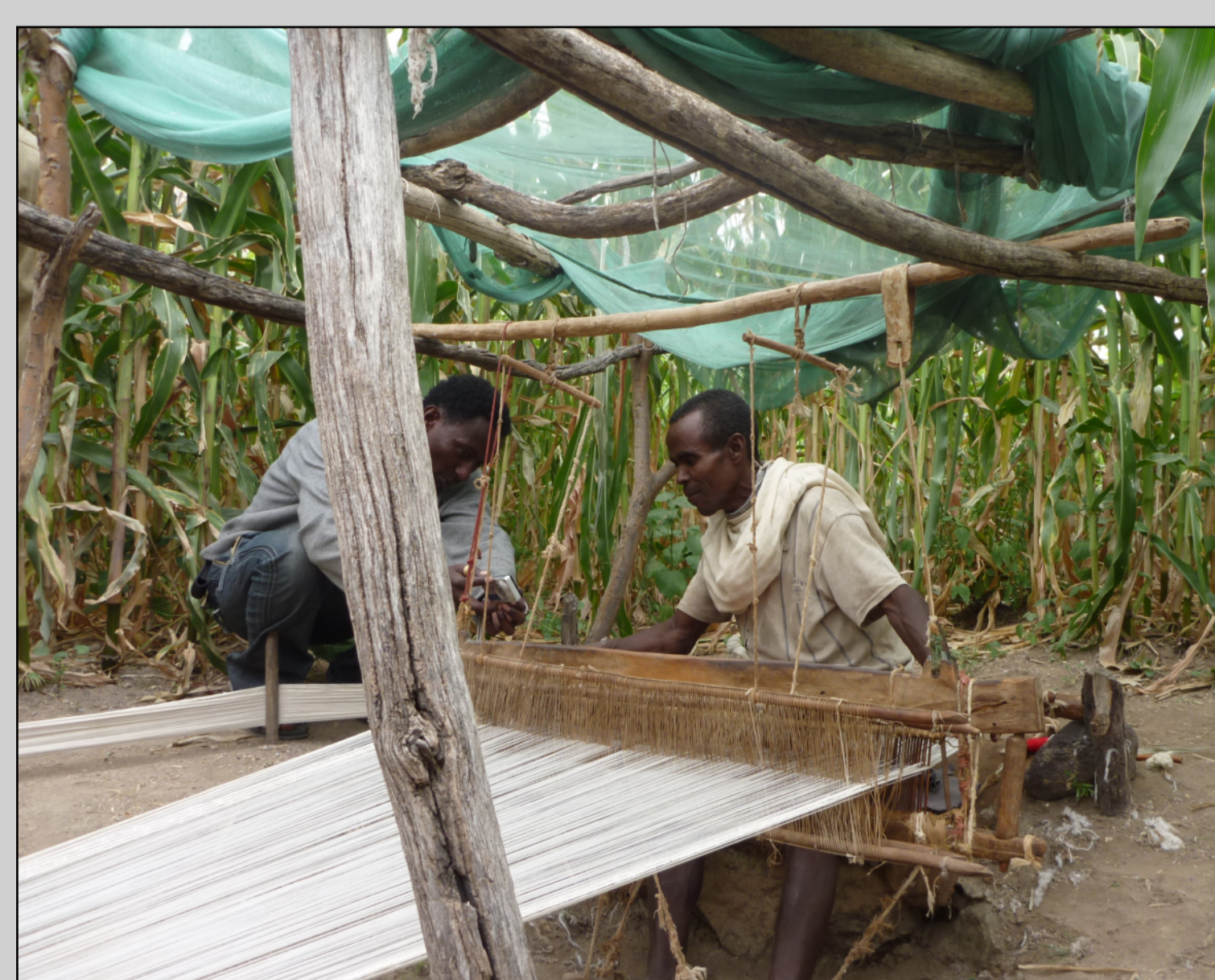
Cotton weaving in Bayso

Specific study topics have been designed according to the research needs of the two languages. Grammatical and ethnographic description is a priority for Bayso since the language and the people are only known by sketchy descriptions. A specific descriptive linguistic topic is the complex relation between grammatical gender and number. On Haro there is a grammar (a PhD thesis) and an ethnographic work (an MA thesis).